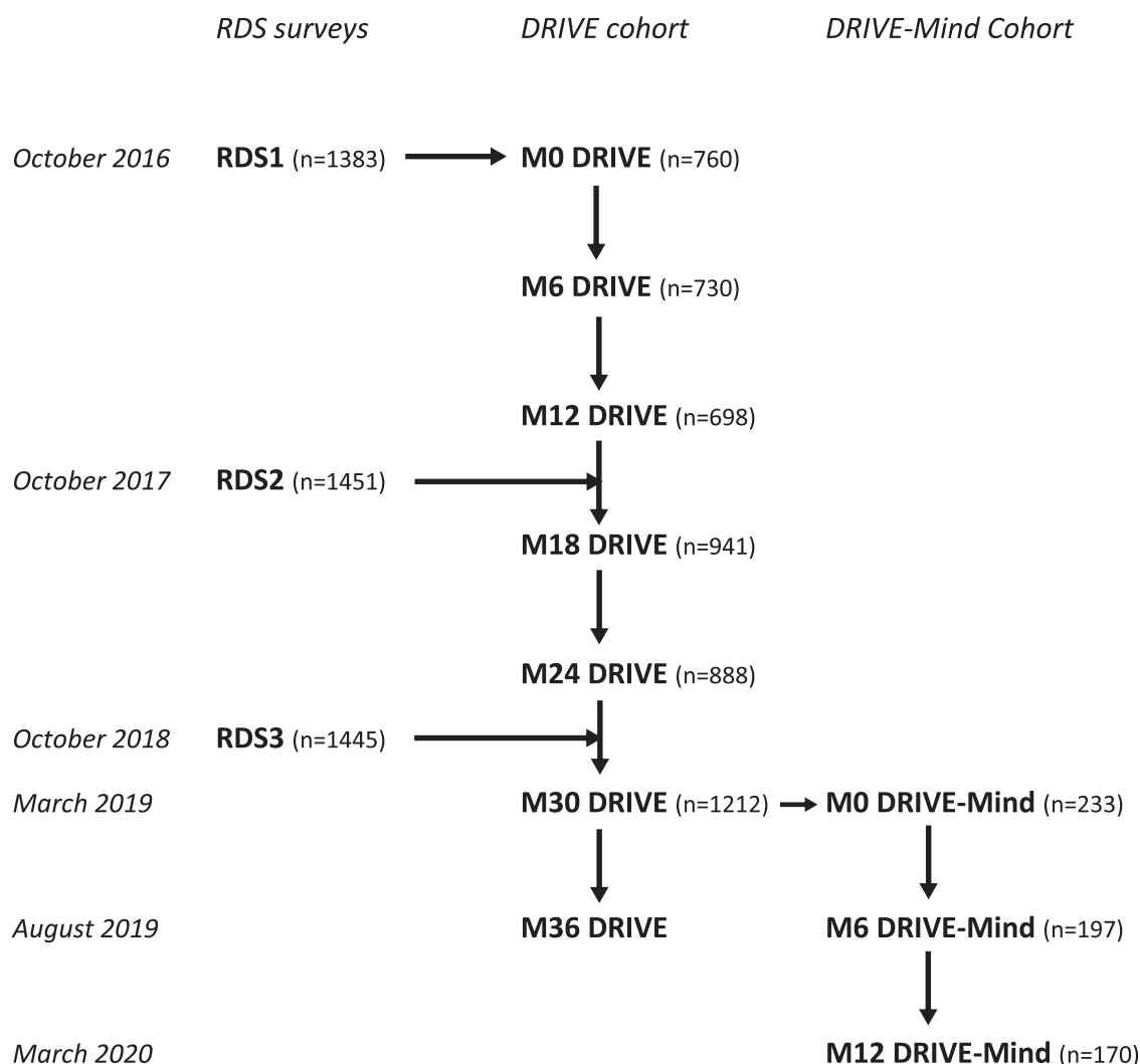
Figure 1. Overview of the DRIVE Project.

At each visit, data on drug use, sexual behaviours and use of drug-related services were collected in face-to-face structured interviews by trained CBO staff.