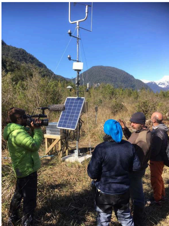
Illustration 4. Mountain areas as a location for educational training; students and professors are informed of the infrastructure of the Patagonia-Exploradores scientific station of the Catholic University of Chile, in 2019.