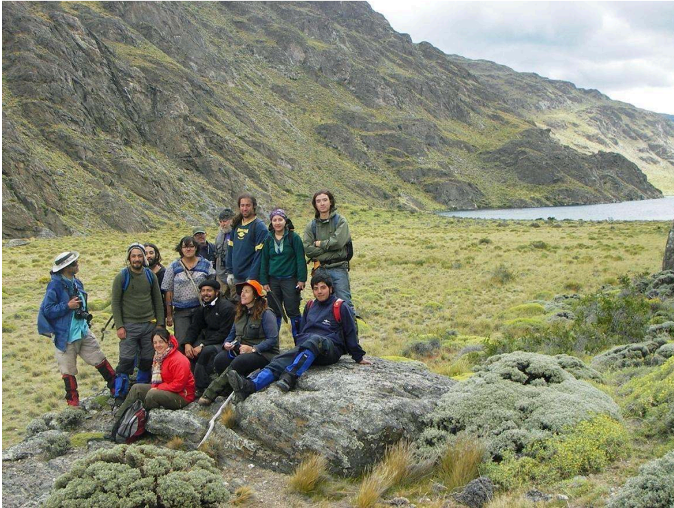
Illustration 2. The mountain area as a place for citizen science; volunteers helping collect biological data in Patagonia Park, 2007.