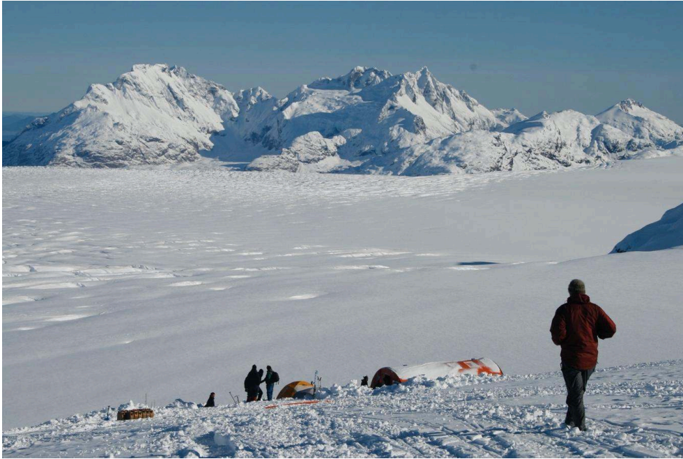
Illustration 1. The mountainous area as research site; a scientific station on the North Patagonian Icefield, Laguna San Rafael National Park 2010