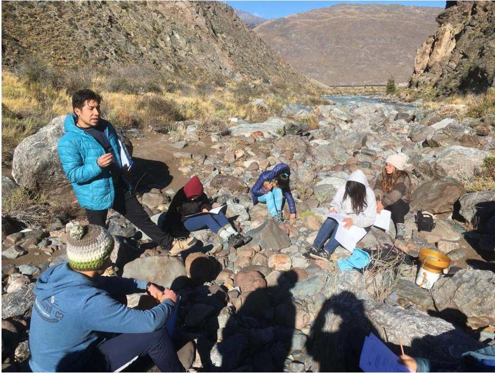
Illustration 3. The mountain area as a support for scientific mediation, a researcher shares his knowledge with students, Patagonia Park, Aysén, in 2019.