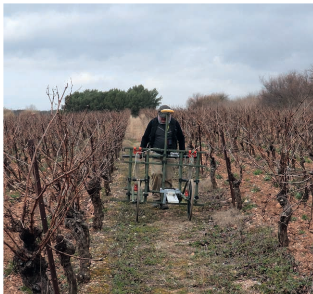
Figure 1. A GEM-2 acquisition system mounted on a Sensys MXPDA cart.

The second site studied is an early Christian necropolis near the ancient city of Augustodunum in central France,