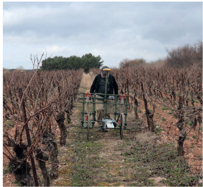
Figure 1. A GEM-2 acquisition system mounted on a Sensys MXPDA cart.

The second site studied is an early Christian necropolis near the ancient city of Augustodunum in central France,