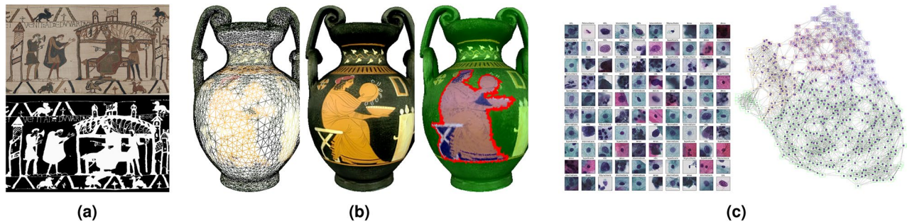
Figure 1. Examples of N-dimensional graphs, and of data processing problems which can be applied to them. (a) A 2D grid graph representing a color image, and the 2D segmentation of this image; (b) a 3D triangular graph representing a colored point cloud, and the 3D segmentation of this point cloud; (c) a ND point cloud graph constructed from a database of cells, and the data clustering of this graph. All these problems can be tackled using the same unified mathematical framework described in the present paper.

on averaging operators which can be designed to solve inverse problems in image, 3D points clouds and data classification based on the transcriptions of such equations on graphs. In “Applications” section, we will provide numerical examples to illustrate the proposed method on real-life problems arising from cultural heritage and medical imaging, before drawing our conclusions in “Discussion” section.