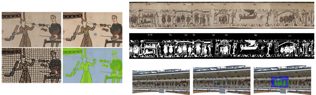
Figure 3. Semi-supervised segmentation of the Bayeux Tapestry. Left: superpixel-based segmentation of a single scene (initial image, image with seeds, image partition with supervertices using a regular grid of seeds, and segmentation result). Right, first and second rows: segmentation of the foreground on 2D images (initial image and segmentation result). Right, third row: 3D point cloud segmentation (from left to right: initial image, image with initial labels, segmentation result).