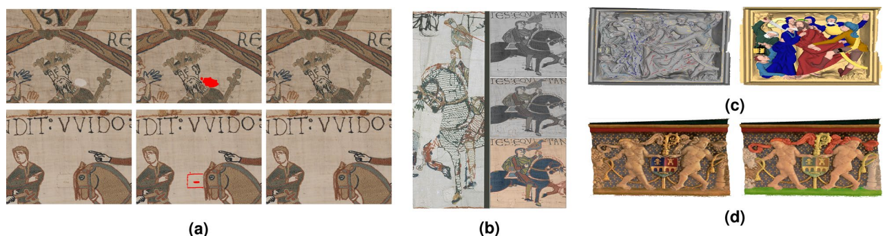
Figure 2. Virtual restoration and colorization. (a) 2D restoration (original images, images with areas to be restored indicated in red, and restoration results). (b) 2D colorization, where the left column represents the backside of a scene from the Bayeux Tapestry, and the second column represents the initial image, the image with seeds, and the colored result. (c, d) 3D colorization, with input models on the left and colored ones on the right.

We conclude this section by applying our approach to semi-supervised classification of cells in a cytological slide into normal and abnormal classes. We first perform segmentation using the eikonal equation as discussed above to extract nuclei. We used 10% seeds on a dataset of 3956 cells extracted from a cytological slide divided