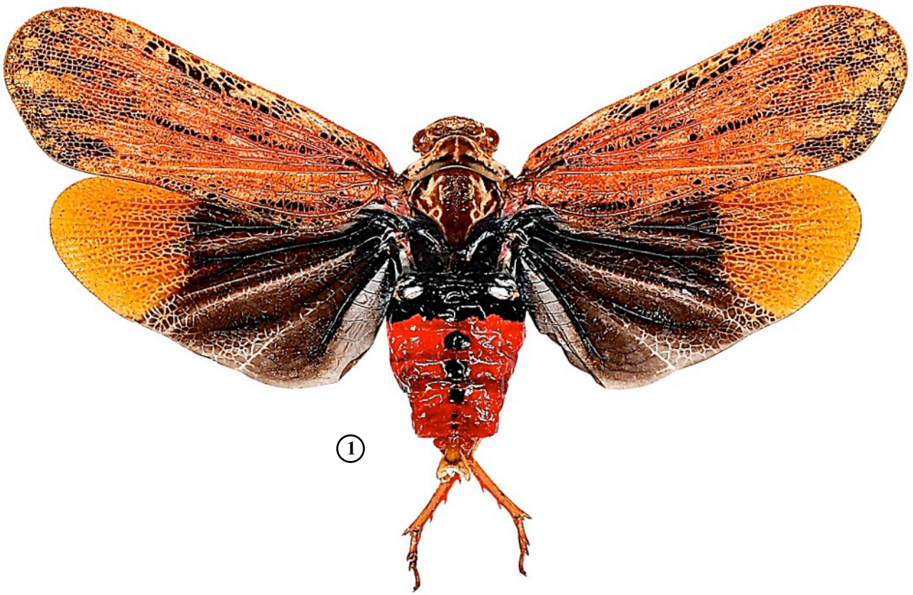
Fig. 1. - Polydictya tanjiewhoi n. sp., ♀, holotype, Sabah (East-Malaysia).