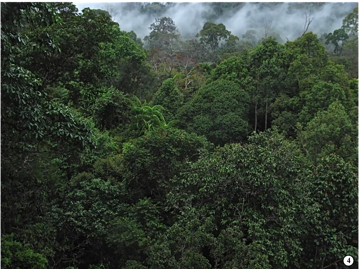
Fig. 3-4. - Biotops from Borneo. Stations of described species: rain forest and view of canopy.