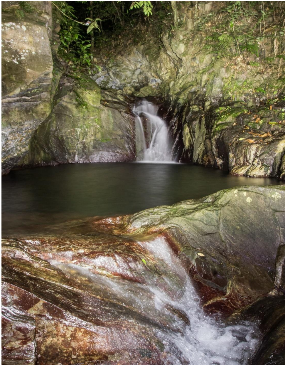
Figure 2. A waterfall on the El Cedro River in Trinidad (West Indies) that separates fish communities where predation on guppies is high (downstream) from communities where predation is more limited. Predation not only leads to trait changes in guppies, but also to changes in ecosystem functioning. This is one of the sites where D. Reznick introduced guppies (upstream) in 1981 to study their evolution in the absence of predation.

difference in density in the populations; the density is indeed much higher when predation is low. The high density in populations with low predation reduces food availability, and vice versa, leading to an existence adapted to these food conditions (e.g. smaller size). Under these conditions, primary productivity is also affected, as are the dynamics of other fishes that compete with guppies ( Rivulus hartii ). We can thus clearly see here the eco-evolutionary loop that operates on the scale of a few tens of generations, involving the different levels of biodiversity, mentioned at the beginning of the article, populations, communities and ecosystems.