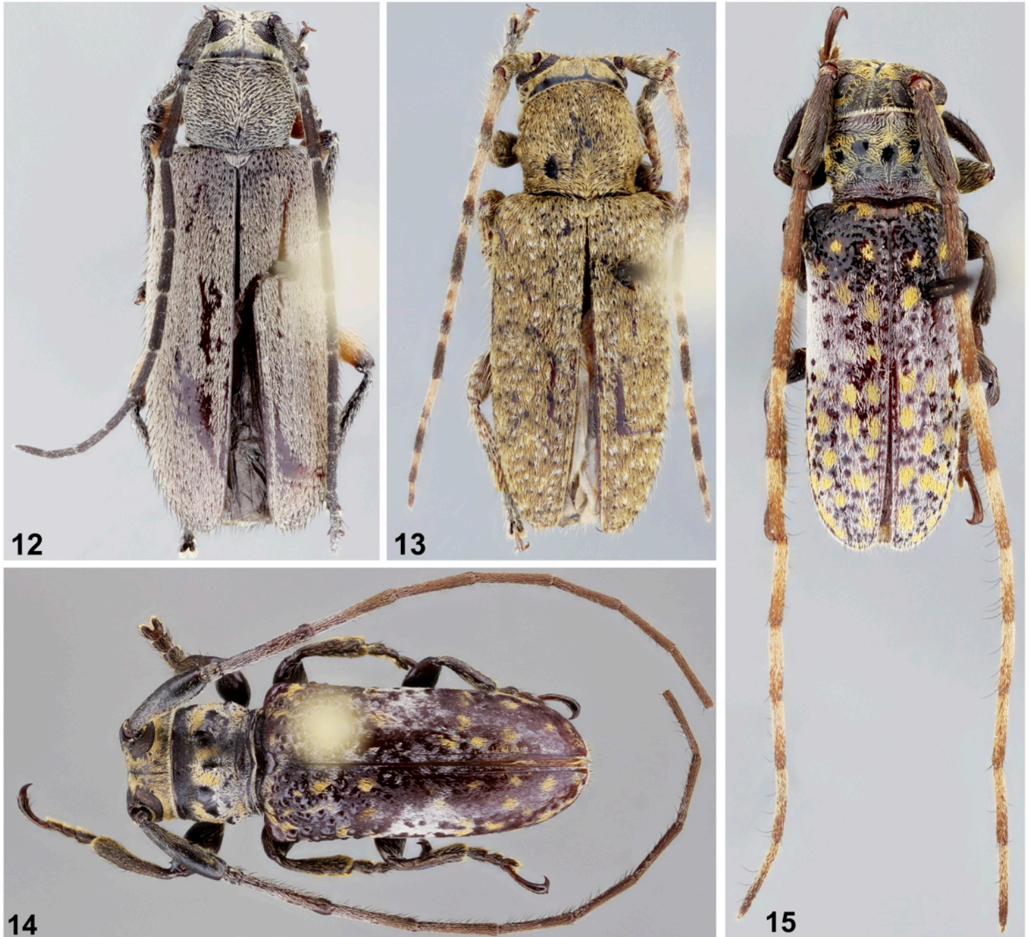
Fig. 12-15. - Dorsal Habitus. – 12: Callisema rufipes , ♀. – 13: Estola ignobilis , ♀. – 14: Oncideres cumdisci , ♂. – 15: Oncideres pepotinga , ♂.