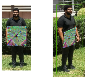
Figure 3. Sample of a successful adversarial attack on the reference view of LAVIS-MVAPE, while it fails to fool the detector at a different angle.

efficiency compared to the one applied to the reference view. In the tests performed on our database, the projected patch was at best half as effective as the reference view patch, losing nearly all of its attack capabilities in some cases.