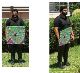
Figure 3. Sample of a successful adversarial attack on the reference view of LAVIS-MVAPE, while it fails to fool the detector at a different angle.

efficiency compared to the one applied to the reference view. In the tests performed on our database, the projected patch was at best half as effective as the reference view patch, losing nearly all of its attack capabilities in some cases.