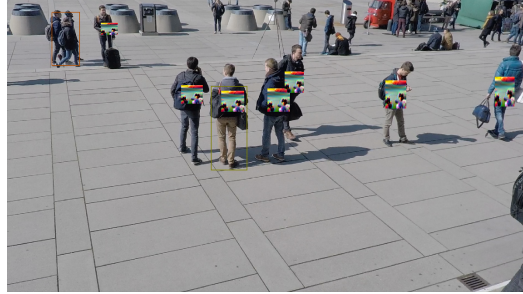
Figure 2. Sample of the Wildtrack view 7 detection results with the patch applied after geometric transformation