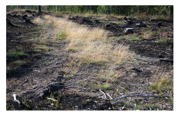
Fig. 3 Deschampsia flexuosa is one of the main pioneer grasses to grow after fire in the boreal forest.

Renforskningen 1955). The answers to Wretlind's questionnaire (Table 1m) are a valuable source of information regarding the effects of prescribed burning as perceived by reindeer herders in the 1950s. However, the results were only displayed in the form of a table, and any of the explanations that reindeer herders would have spontaneously provided have not been recorded. Presenting the same questionnaire to Malå reindeer herders today (Table 2) allowed a comparison of the answers given then and now, but above all offered the opportunity to interpret and nuance the "yes/no" answers recorded in 1954, by addressing the herders' extensive knowledge about reindeer grazing and grazing conditions. With this process, it is also essential to admit the anachronism of the approach, because of the differences in past and present contexts related to reindeer herding, and to identify sources of discrepancy. For instance, since the 1950s the composition of the boreal forest landscape has changed, in part because of the forestry industry, while ecological functions have not. Likewise, both reindeer herds and the practice of Sami herding have changed, notably in reaction to landscape transformations and modernization. However, the knowledge held by the herders about managing reindeer in the boreal forest is still present and can help us understand these changes.