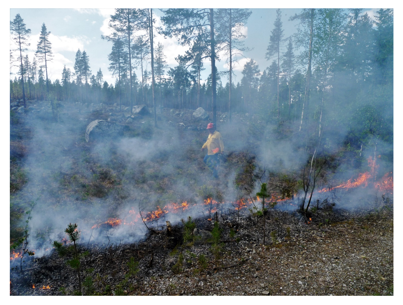
Figure 2. Regeneration burning with seed trees in 2009. The visible fire line follows a gravel road, which is a good firebreak.

connected to a water source and a network of hoses is always present at the burning site in case of accidental ignitions in adjacent forest stands due to flying sparks. Burning practitioners can also wet the logging debris and brushwood along the edges of the stand that appear less safe. Nowadays, some burning practitioners use thermal cameras to detect fire sources and some use helicopters to monitor the progress of the burning and to damp down the stand if necessary. Once the burning is completed, the stand must be watched day and night until the risk of re-ignition has passed.