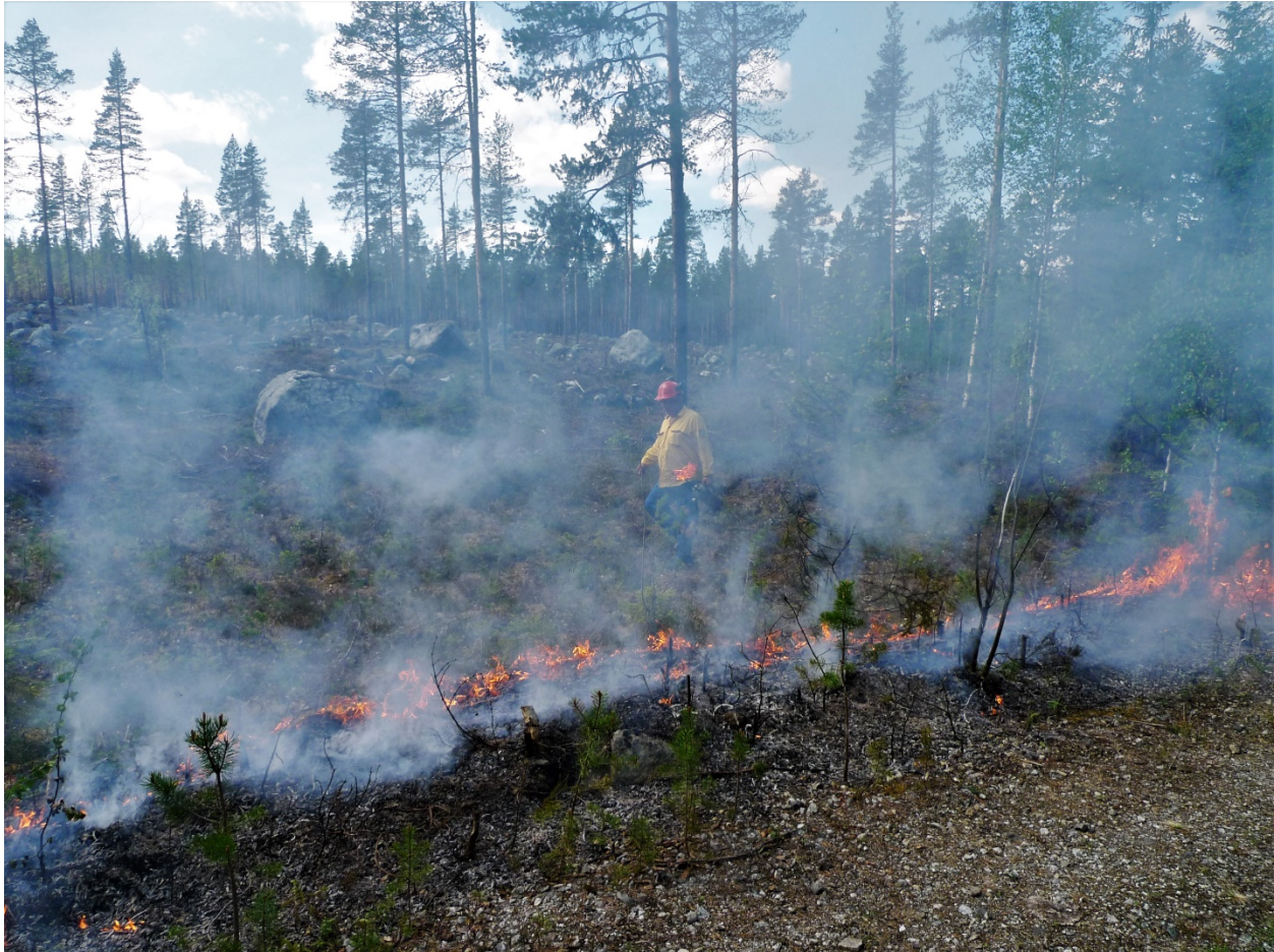
Figure 2. Regeneration burning with seed trees in 2009. The visible fire line follows a gravel road, which is a good firebreak.

connected to a water source and a network of hoses is always present at the burning site in case of accidental ignitions in adjacent forest stands due to flying sparks. Burning practitioners can also wet the logging debris and brushwood along the edges of the stand that appear less safe. Nowadays, some burning practitioners use thermal cameras to detect fire sources and some use helicopters to monitor the progress of the burning and to damp down the stand if necessary. Once the burning is completed, the stand must be watched day and night until the risk of re-ignition has passed.