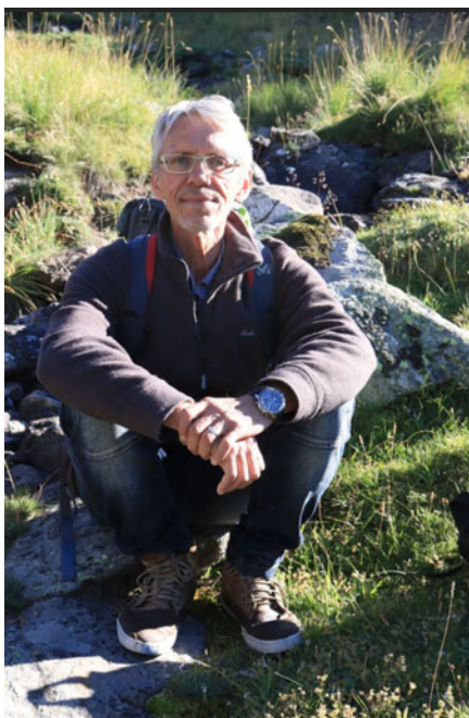
Jérôme Balesdent 1957–2020

LSCE - CEA CNRS UVSQ, Université Paris Saclay, Gif-sur-Yvette 91191, France