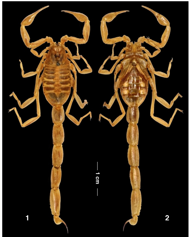
Fig. 1-2. Buthacus sadinei sp. n., ♂ holotype, habitus (dried specimen). 1. Dorsal aspect. 2. Ventral aspect.

Coloration . – Generally yellowish without any spots or pigmented zones on the body and appendages. Prosoma: carapace yellowish; only the eyes surrounded by black pigment. Mesosoma: yellowish. Metasoma: all segments yellowish. Vesicle yellowish; aculeus yellowish at the base and reddish at its extremity. Venter yellowish; pectines yellowish. Chelicerae yellowish without any reticulation; teeth reddish. Pedipalps: yellowish overall, paler than body; the rows of granules on the dentate margins of the fingers reddish. Legs yellowish, paler than body.