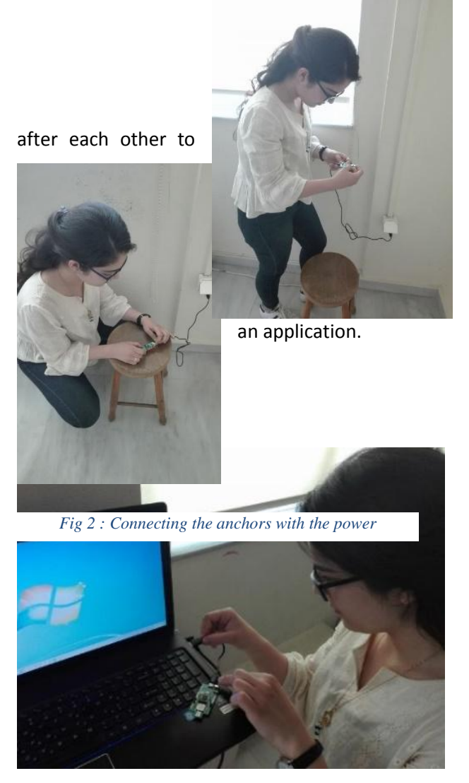
Figure 3: Connecting the tag with Laptop