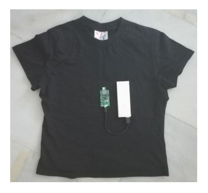
Fig 9 : Tthe T-shirt of the experimentaion

The experimentation gives us a graphical representation, it represents the timestamp between the transmission and the reception of the signals, the anchor identifier, the tag identifier and the distance between the specific tag and anchor pair.