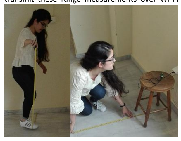
Fig 1: Doing the plan of the house and the measurements between the anchors and point Zero

The third step was to make a plan for a house, which we divided into two bedrooms, a living room, a study room, a kitchen, and a bathroom. In order to discover how the Localino works. It is very important to make the experiment indoor first. We fixed three anchors in different places, and we tried to make a large distance between them (Number 1 in the bedroom, number 2 in the study room and number 3 in the living room). After that, we put the transmitter in the clothing of the person; now he was ready to change his position, so we can be able to measure the distance between the anchors transmitter. Anchors are located at fixed locations in a room and the person that should be tracked wears the tags. The tag then sends signals to the anchors and the anchors measure the time between the transmission and the reception of the signals. So the anchors can estimate how far away from the tag they are which means if you have three anchors you get three range measurements and you have three circles around the anchor and you can triangulate and measure the intersection and know where the position of the tip. So the more accurate the range measurement is the more accurate the intersection and the more accurate the position. Then once this range was measured, the anchors transmit these range measurements over WI-FI