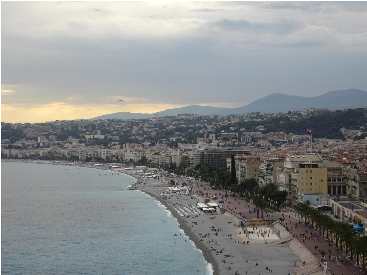
Figure 3. The bay of Nice, the beach and the Promenade des Anglais (July 2020)

Hotels and villas were also built to offer sea views, as enjoying the visible landscape was a must of the stay. This trend grew substantially after the arrival of the railway line in the 1860's. The city, like other resorts of the Riviera (Monaco, Cannes, Antibes), experienced a fast urban development. Very frequently, it also hosted famous political leaders, aristocrats, and artists, who all participated to its celebrity. During the 20th century, Nice continued to develop as a resort, but it turned into a summer one instead of winter resort. After World War 1st, tourism evolved, and summer became the most frequented period of the year. After World War 2nd, the city sprawled a lot because of the ongoing economic boom and the dissemination of personal cars. Today, like many other cities, Nice intends to diversify its activities, but it remains mainly a spot for tourism and secondary homes. These two activities are at the roots of the whole urban system, and they strongly rely on the sea and the beach as a place for entertainment and recreation, and as a major component of the highly promoted landscape of the Riviera. The central shoreline is highly valued, as a major amenity with its beach and promenade, making this an essential part of the city's urban maritime identity. Indeed, Nice has, with a linear shoreline of 17 km, 126 000 m 2 of public beach, as measured with GIS on aerial photographs.