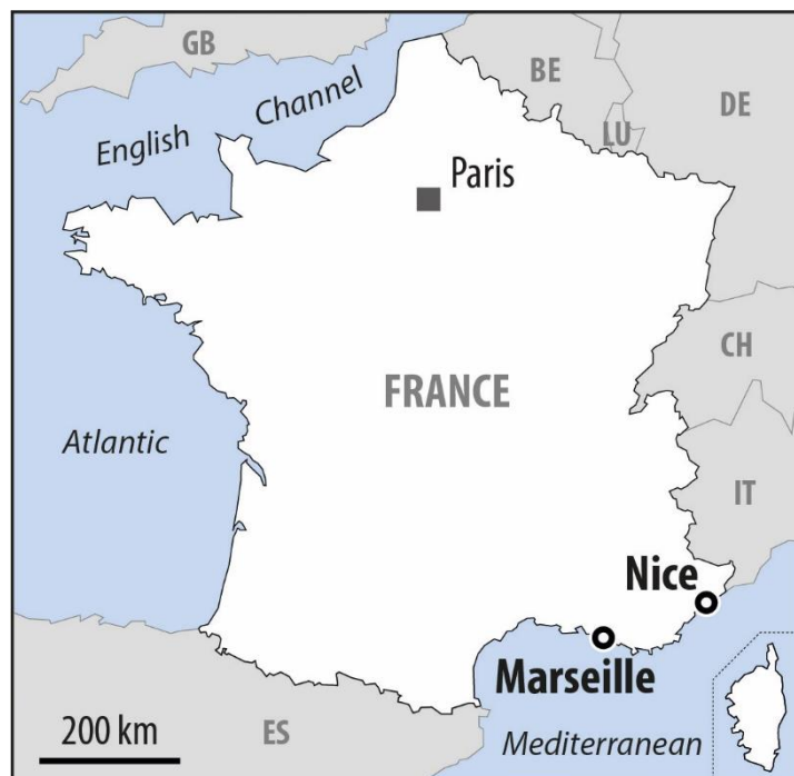
Figure 1. Geographical location of Marseilles and Nice, Southern France.