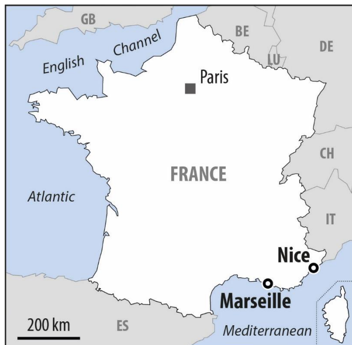
Figure 1. Geographical location of Marseilles and Nice, Southern France.