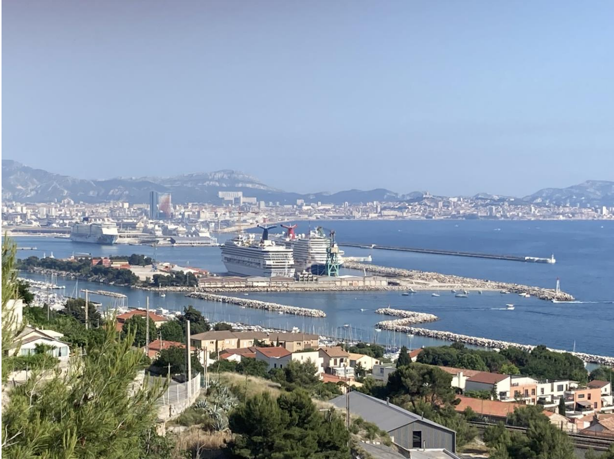
Figure 2. The harbour of Marseilles as seen from the North (June 2021)

More recently, particularly during the last two decades, Marseilles also developed as a cultural and tourist spot, to enlarge the panel of its activities. In 2012, the southern part of its territory and the adjacent marine space was included into the Calanques National Park, an area recognized for its outstanding biodiversity and beautiful landscapes. In 2013, the city was elected European capital of culture, which had a booster effect on the whole territory. Before the Covid-19 pandemic, its port ranked 1st in France and 5th in the Mediterranean for Cruise passengers. Undoubtedly, Marseilles is very much related to the sea. This very old relation is under renewal, but it remains highly based on productive activities, marine shipping, and innovation. To sum up, its urban maritime identity covers especially commercial and navigational aspects. Although the city has 57 km of linear coastline (Direction de la Mer de la Ville de Marseille, 2021), the public beaches where residents can practice the sea, cover only 91 000m 2 as measured with GIS on aerial photographs.