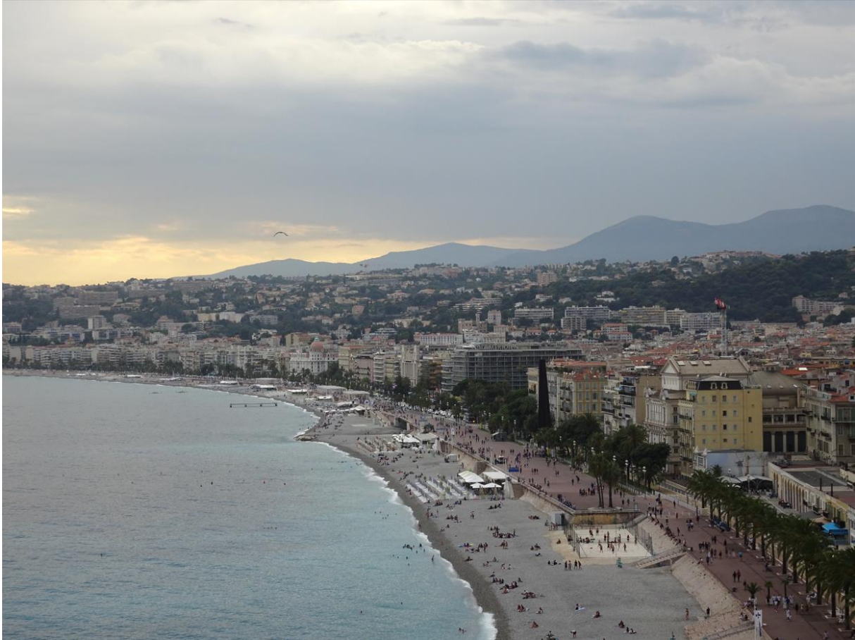
Figure 3. The bay of Nice, the beach and the Promenade des Anglais (July 2020)

Hotels and villas were also built to offer sea views, as enjoying the visible landscape was a must of the stay. This trend grew substantially after the arrival of the railway line in the 1860's. The city, like other resorts of the Riviera (Monaco, Cannes, Antibes), experienced a fast urban development. Very frequently, it also hosted famous political leaders, aristocrats, and artists, who all participated to its celebrity. During the 20th century, Nice continued to develop as a resort, but it turned into a summer one instead of winter resort. After World War 1st, tourism evolved, and summer became the most frequented period of the year. After World War 2nd, the city sprawled a lot because of the ongoing economic boom and the dissemination of personal cars. Today, like many other cities, Nice intends to diversify its activities, but it remains mainly a spot for tourism and secondary homes. These two activities are at the roots of the whole urban system, and they strongly rely on the sea and the beach as a place for entertainment and recreation, and as a major component of the highly promoted landscape of the Riviera. The central shoreline is highly valued, as a major amenity with its beach and promenade, making this an essential part of the city's urban maritime identity. Indeed, Nice has, with a linear shoreline of 17 km, 126 000 m 2 of public beach, as measured with GIS on aerial photographs.