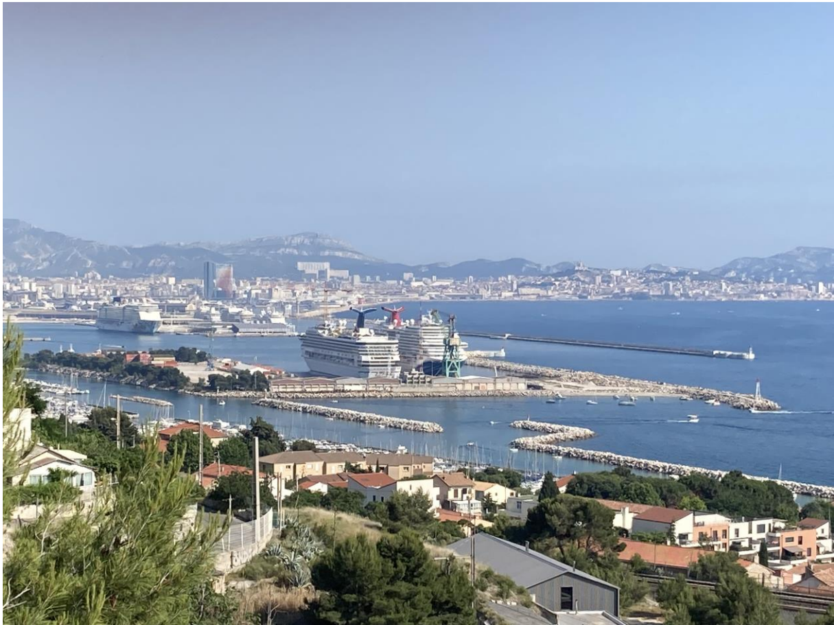
Figure 2. The harbour of Marseilles as seen from the North (June 2021)

More recently, particularly during the last two decades, Marseilles also developed as a cultural and tourist spot, to enlarge the panel of its activities. In 2012, the southern part of its territory and the adjacent marine space was included into the Calanques National Park, an area recognized for its outstanding biodiversity and beautiful landscapes. In 2013, the city was elected European capital of culture, which had a booster effect on the whole territory. Before the Covid-19 pandemic, its port ranked 1st in France and 5th in the Mediterranean for Cruise passengers. Undoubtedly, Marseilles is very much related to the sea. This very old relation is under renewal, but it remains highly based on productive activities, marine shipping, and innovation. To sum up, its urban maritime identity covers especially commercial and navigational aspects. Although the city has 57 km of linear coastline (Direction de la Mer de la Ville de Marseille, 2021), the public beaches where residents can practice the sea, cover only 91 000m 2 as measured with GIS on aerial photographs.