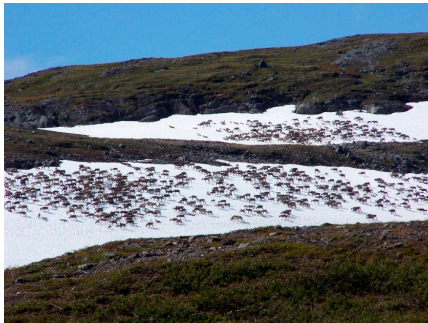
Figure 2. Free-ranging reindeer in their summer grazing lands, in Sarek National Park, Sweden.

Even though the atypical CWD hypothesis reassures reindeer herders, they are obviously worried about the possible consequences of CWD cases in their herds. The culling in Nordfjella created a dramatic precedent for them, a sword of Damocles poised over their herds. Beyond reindeer herders, all the stakeholders we interviewed agreed on the fact that, if it happens, the impact of CWD on reindeer herding would be catastrophic for the reindeer herding industry and for Sami culture. CWD in Sami reindeer husbandry would have disastrous outcomes. A herder with an infected reindeer would lose all his herd, including all the reindeer of his family and other members of the community, and would probably have to quit this activity because of the possible contamination of the environment and the difficulty of starting a new herd (pers. comm., interview 6, 7, 12, 13). Also, for the herders we talked to, a case in reindeer herding might mean that it is already too late because the reindeer mix with each other and move a lot (Figure 2). For them, a case would imply existing spread of the disease (pers. comm., interviews 7, 9, 11, 12, 13, 14, 18). For the SSR representative, the Nordfjella strategy consisting of 'cleaning' an area of CWD would not work in the reindeer herding context because of the herds mixing with each other, especially in summer, and because of seasonal migrations (pers. comm., interview 18).