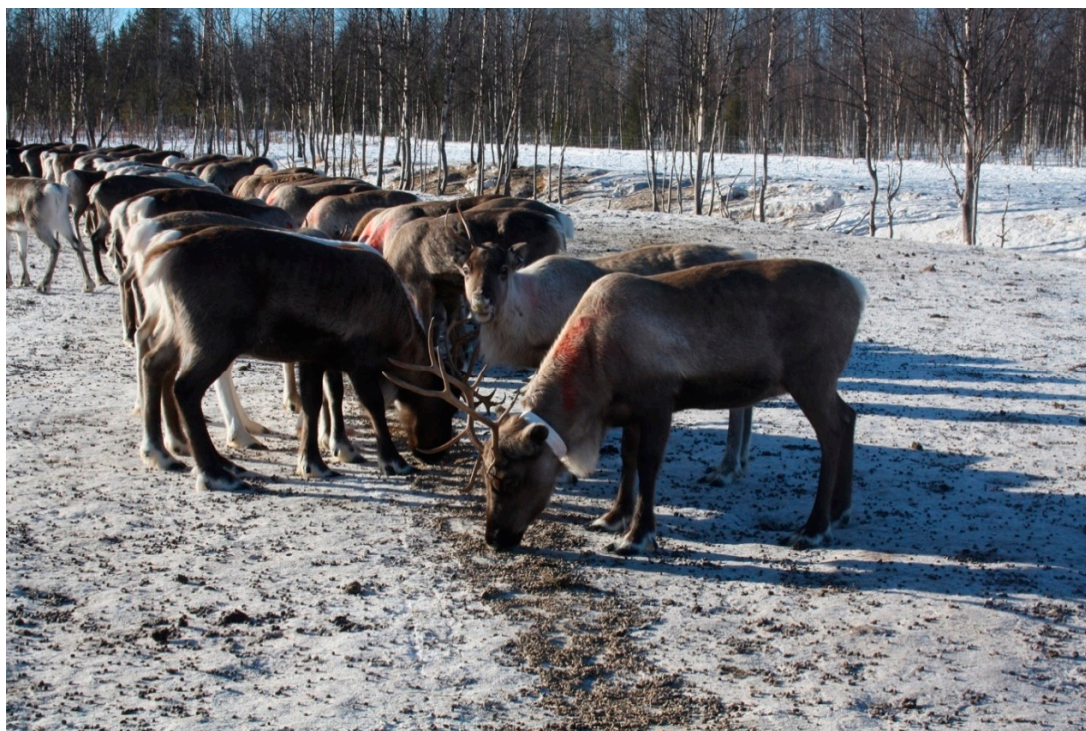
Figure 3. Reindeer consuming feed brought into their winter grazing lands in Pajala, Sweden. Herders can supply reindeer with industrial pellets or silage to avoid them starving. Reindeer can be kept in corrals or be fed in the forest too.

have already changed the behavior of reindeer and the conditions of herding, and CWD management could accelerate the move. Going towards a farming model would also have dramatic consequences with the loss of the pastoralist culture, practices and knowledge that will be irreversible (pers. comm., interview 6). Sweden and the EU are not actively pushing for reindeer farms, but the possibility is raised by CWD (pers. comm., interviews 17, 19). This is not surprising since health crises are opportunities for authorities to interfere and make changes of various kinds [19,21,64], including in pastoral, nomad societies that often escape state control [58,65].