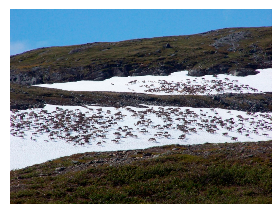
Figure 2. Free-ranging reindeer in their summer grazing lands, in Sarek National Park, Sweden.

Even though the atypical CWD hypothesis reassures reindeer herders, they are obviously worried about the possible consequences of CWD cases in their herds. The culling in Nordfjella created a dramatic precedent for them, a sword of Damocles poised over their herds. Beyond reindeer herders, all the stakeholders we interviewed agreed on the fact that, if it happens, the impact of CWD on reindeer herding would be catastrophic for the reindeer herding industry and for Sami culture. CWD in Sami reindeer husbandry would have disastrous outcomes. A herder with an infected reindeer would lose all his herd, including all the reindeer of his family and other members of the community, and would probably have to quit this activity because of the possible contamination of the environment and the difficulty of starting a new herd (pers. comm., interview 6, 7, 12, 13). Also, for the herders we talked to, a case in reindeer herding might mean that it is already too late because the reindeer mix with each other and move a lot (Figure 2). For them, a case would imply existing spread of the disease (pers. comm., interviews 7, 9, 11, 12, 13, 14, 18). For the SSR representative, the Nordfjella strategy consisting of 'cleaning' an area of CWD would not work in the reindeer herding context because of the herds mixing with each other, especially in summer, and because of seasonal migrations (pers. comm., interview 18).