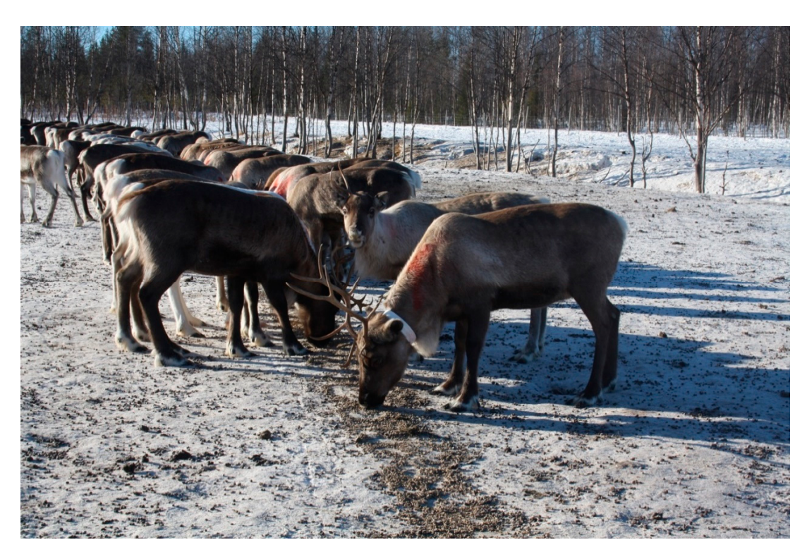
Figure 3. Reindeer consuming feed brought into their winter grazing lands in Pajala, Sweden. Herders can supply reindeer with industrial pellets or silage to avoid them starving. Reindeer can be kept in corrals or be fed in the forest too. Source: A. Poiret, March 2019.

have already changed the behavior of reindeer and the conditions of herding, and CWD management could accelerate the move. Going towards a farming model would also have dramatic consequences with the loss of the pastoralist culture, practices and knowledge that will be irreversible (pers. comm., interview 6). Sweden and the EU are not actively pushing for reindeer farms, but the possibility is raised by CWD (pers. comm., interviews 17, 19). This is not surprising since health crises are opportunities for authorities to interfere and make changes of various kinds [19,21,64], including in pastoral, nomad societies that often escape state control [58,65].