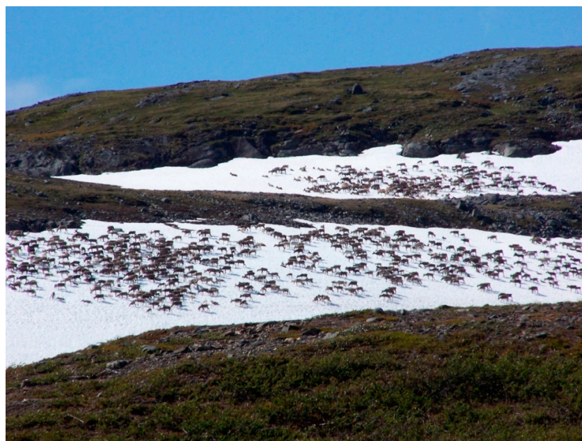
Figure 2. Free-ranging reindeer in their summer grazing lands, in Sarek National Park, Sweden.

Even though the atypical CWD hypothesis reassures reindeer herders, they are obviously worried about the possible consequences of CWD cases in their herds. The culling in Nordfjella created a dramatic precedent for them, a sword of Damocles poised over their herds. Beyond reindeer herders, all the stakeholders we interviewed agreed on the fact that, if it happens, the impact of CWD on reindeer herding would be catastrophic for the reindeer herding industry and for Sami culture. CWD in Sami reindeer husbandry would have disastrous outcomes. A herder with an infected reindeer would lose all his herd, including all the reindeer of his family and other members of the community, and would probably have to quit this activity because of the possible contamination of the environment and the difficulty of starting a new herd (pers. comm., interview 6, 7, 12, 13). Also, for the herders we talked to, a case in reindeer herding might mean that it is already too late because the reindeer mix with each other and move a lot (Figure 2). For them, a case would imply existing spread of the disease (pers. comm., interviews 7, 9, 11, 12, 13, 14, 18). For the SSR representative, the Nordfjella strategy consisting of 'cleaning' an area of CWD would not work in the reindeer herding context because of the herds mixing with each other, especially in summer, and because of seasonal migrations (pers. comm., interview 18).