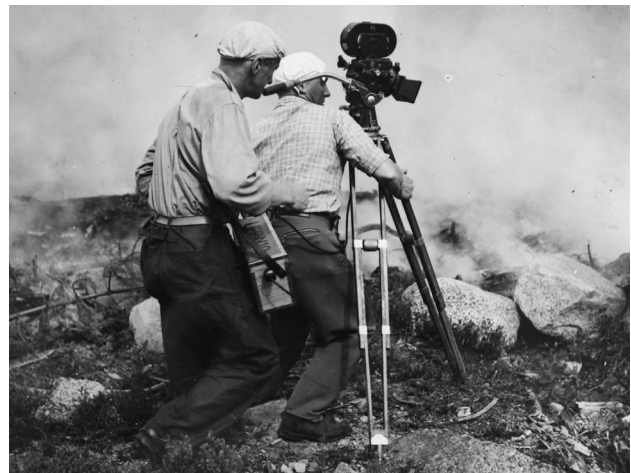
Fig. 4 A photograph taken during the filming of a movie in 1947 on prescribed burning in Malå: “ Photographer Gustavson at the camera, and an assistant from Malå. ”

Even after he had proven himself, and after he retired in 1951, Wretlind continued to promote prescribed burning. For example, in 1955, Wretlind was asked to provide feedback on a circular letter about safety measures to be employed during prescribed burning. In his answer, Wretlind argued that prescribed burning had proven to be an indispensable regeneration measure and therefore should not be “ either discredited or unnecessarily complicated by superfluous rules ” (Table 1: W-DH-letter-1955). Irrespective of the debates and disagreements that Wretlind could trigger, he succeeded in convincing the forestry community, and in the following decades, his methods have been widely applied by both private owners and forestry companies in Malå district and also across the whole of northern Sweden (Jonsson 1965; Kardell 2004). Wretlind was made a member of the Royal Academy of Agriculture and Forestry, a commander of the Order of Vasa and an honorary doctor at the Royal Forestry Institute in 1957 (Öckerman 1998). He was recognized as the forerunner of the prescribed burning technique that came to be an essential step in the regeneration of northern Sweden's raw-humus forests (Ebeling 1959; Jonsson 1965).