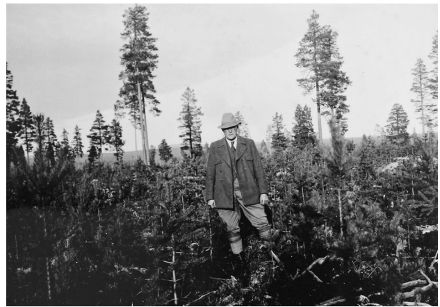
Fig. 1 Forest manager Joel E. Wretlind in 1947.

The wide application of prescribed burning for forest regeneration purposes in the 1950–1960s in northern Sweden is today attributed to the influence of one of its strong advocates, Joel Efraim Wretlind (1888–1965), forest manager for the Malå district forests from 1920 to 1952 (Granström 1991; Pyne 1997; Fig. 1). Sometimes called “ the father of prescribed burning ” (Segerstedt 2015), or the “ prophet of modern forestry ” (Öckerman 1998), and now an emblematic person within northern Sweden’s forestry community, his mission was