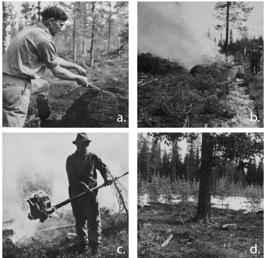
Fig. 3 Different steps of the prescribed burning system carried out under Wretlind: a burning anthills; b burning along a firebreak; c lighting the fire with a birch-bark torch; d Scots pine saplings growing around a seed tree.

burning practitioners, and too expensive when carried out on small stands (Ebeling 1959). Both clear-cutting and prescribed burning were controversial methods that went against the watchword of carefulness that prevailed in the forestry industry at the time (Öckerman 1998). Wretlind had to convince his superiors, who were skeptical about his methods, that they were the only way to ensure forest regeneration in the interior of Lapland and to let him carry out his trials: