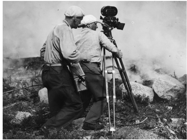
Fig. 4 A photograph taken during the filming of a movie in 1947 on prescribed burning in Malå: “ Photographer Gustavson at the camera, and an assistant from Malå. ”

Even after he had proven himself, and after he retired in 1951, Wretlind continued to promote prescribed burning. For example, in 1955, Wretlind was asked to provide feedback on a circular letter about safety measures to be employed during prescribed burning. In his answer, Wretlind argued that prescribed burning had proven to be an indispensable regeneration measure and therefore should not be “ either discredited or unnecessarily complicated by superfluous rules ” (Table 1: W-DH-letter-1955). Irrespective of the debates and disagreements that Wretlind could trigger, he succeeded in convincing the forestry community, and in the following decades, his methods have been widely applied by both private owners and forestry companies in Malå district and also across the whole of northern Sweden (Jonsson 1965; Kardell 2004). Wretlind was made a member of the Royal Academy of Agriculture and Forestry, a commander of the Order of Vasa and an honorary doctor at the Royal Forestry Institute in 1957 (Öckerman 1998). He was recognized as the forerunner of the prescribed burning technique that came to be an essential step in the regeneration of northern Sweden's raw-humus forests (Ebeling 1959; Jonsson 1965).