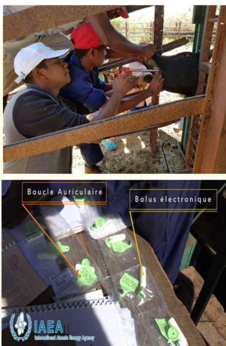
Figure 1: Introduction of the electronic bolus into the rumen of cattle.

the immaturity of the digestive system of young ruminants, and the presence of the esophageal gutter that makes the mouth communicate directly to the abomasum, retention tests will be carried out to determine the age and ideal weight for the introduction of the electronic bolus. A portable reader (DATA MARS) was used to read the unique numbers contained in the transponders. For example, cattle with electronic puce were tested monthly during the five years of the project, using this reader to determine the bolus retention rate and other criteria related to the operation of the electronic system. During laughter, the bolus is easily recovered in the reticulum. After recovery, the boluses must be destroyed to avoid any further reuse of this device [25].