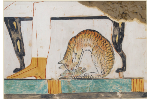
Figure 2 | Spatio-temporal representation of the alleles determining the phenotypic variation in the shape of tabby patterns, mackerel (TaM) and blotched (Tab). To overcome issues of potential allelic drop-out, each individual is defined by at least one observed allele, except for the few instances in which both alleles were detected. The image shows a ‘cat under the chair’ with a tabby mackerel marking, typical of F. silvestris lybica (Anna (Nina) Macpherson Davies, Copy of Wall Painting from Private Tomb 52 of Nakht, Thebes (I, 1, 99–102) Cat Eating Fish. Photo: © Ashmolean museum, Oxford, UK).