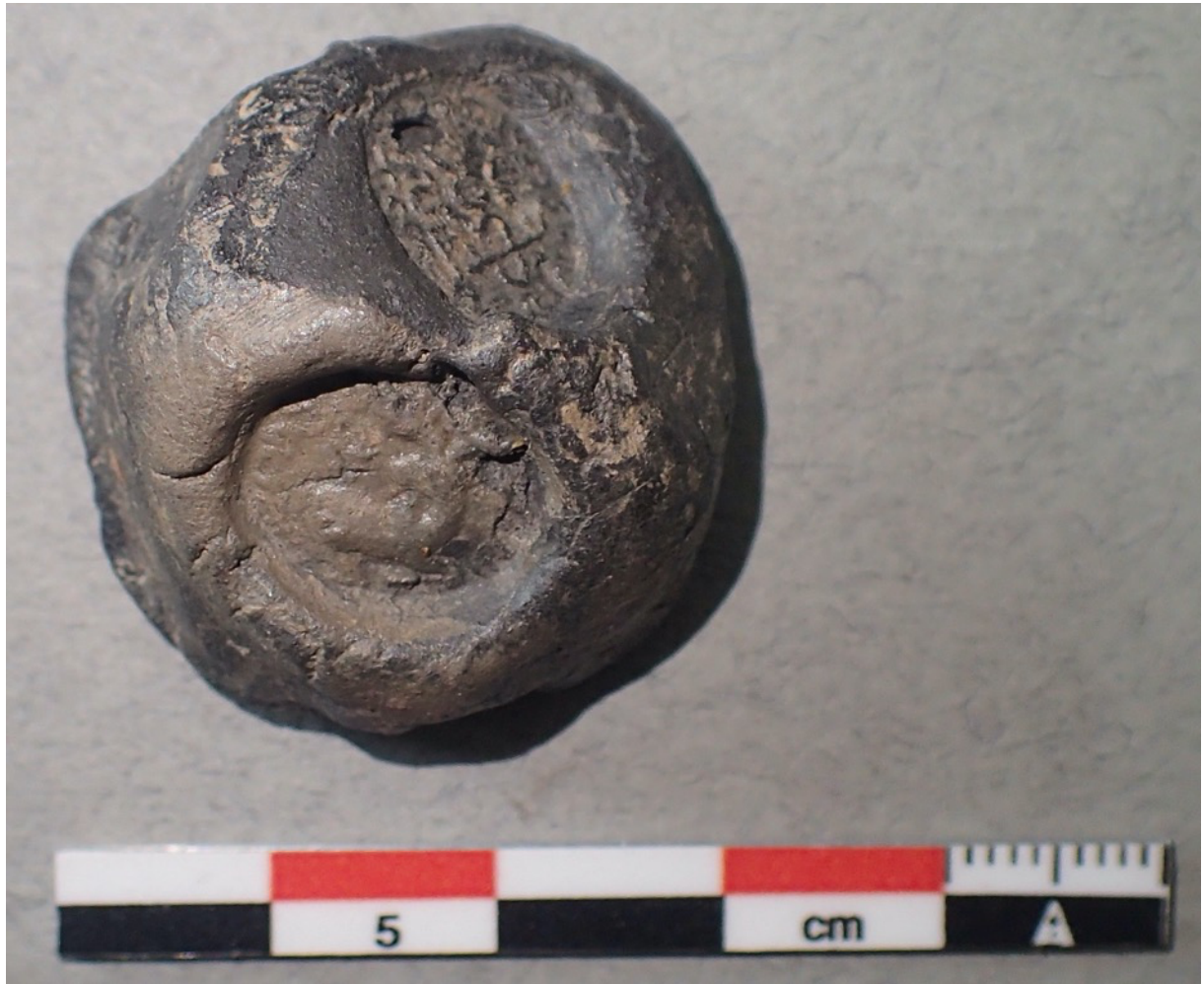
Figure 1: a. Sasanian seal, Oriental Institute Museum (A3731). b. Sasanian bullae, Qasr-i Abu Nasr excavation, National Museum of Iran (1910095)

More generally, the interpretation of the images remains attached to what we know about Zoroastrianism in late antiquity (for example Jakubiak 2011). This “Zoroastrian approach” is relevant and can be explained by the weight of this Church in the functioning of Sasanian society. Imperial and clerical power were closely linked, and the Zoroastrian priests had an important place in the state administration (Azarnouche 2018a: 126 and ff). It is therefore legitimate to consider that the iconographies of the seals used in this administration must have had a link with Zoroastrian doctrine. Moreover, the Zoroastrian approach also depends on the state of the sources, particularly on the textual sources, the vast majority of which belong to the Zoroastrian corpus iv . However, if the Zoroastrian dimension is to be considered in the analysis of the iconographies of the Sasanian glyptic, its pre-eminence should be qualified. Shaul Shaked's work has shown the existence of a