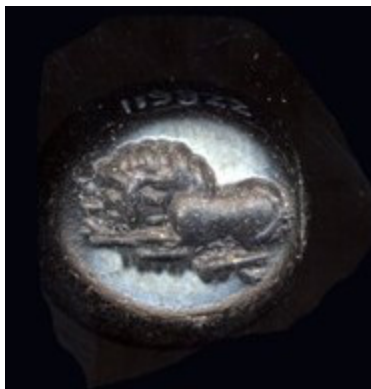
Figure 4: Asleep lion, Sasanian seal, British Museum (119822), ©Trustees of the British Museum

beyond the action of sealing. It makes it possible to consider these objects as a support for the diffusion of zoological knowledge xxiv , whether or not this diffusion has been sought.