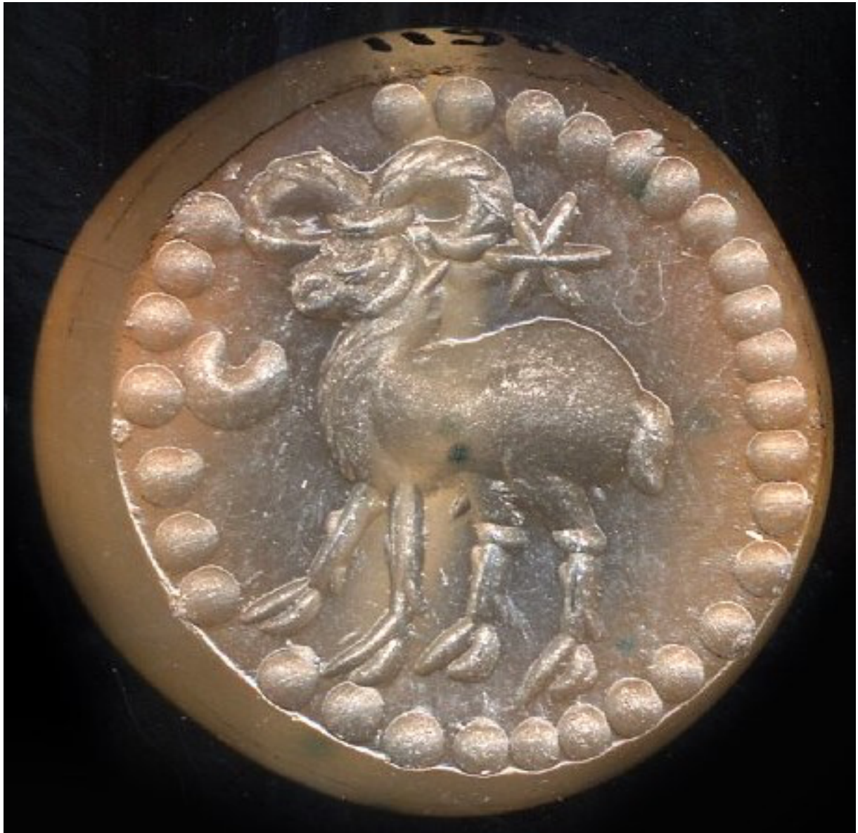
Figure 2: Bighorn sheep, Sasanian seal, British Museum (119850), ©Trustees of the British

The theme of hunting, and more broadly, the theme of the hunter-king, are millennia old and widespread in all the cultures of the ancient Near East: one of its oldest representations can be found on the so-called lion-hunt stele at Uruk, dating to circa 3000 BCE (Seyer 2006: 171). The figure of the hunter-king seems to be linked, rather quickly, to the figure of the victorious king. The art of the New Kingdom Egypt gives us an example of these two topoi's affinity. On the chest of Tutankhamun's treasure, the pharaoh is depicted fighting against his enemies on the sidewalls, and against various animals on the lid (Seyers 2006: 174). In Mesopotamia, during the Assyrian