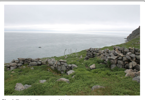
Fig. 2 The old village site of Naukan

The village of Naukan (originally called Nevuqaq) (Fig. 2) was built on Cape Dezhnev, at the extreme eastern end of Eurasia. Subsistence practices focused on hunting sea mammals including the gray whale ( Eschrichtius robustus ), walrus ( Odobenus rosmarus ), spotted seal ( Phoca largha ), and bearded seal ( Erignathus barbatus ). This was supplemented by hunting of land mammals and gathering of plants and smaller marine organisms. During the Russian Imperial and early Soviet period, the site served as an important center for commercial and cultural exchange between the Chukchi on the Russian side and the Iñupiat on the Alaskan side of the Bering Strait. Intermarriages were common between the people of Naukan and the