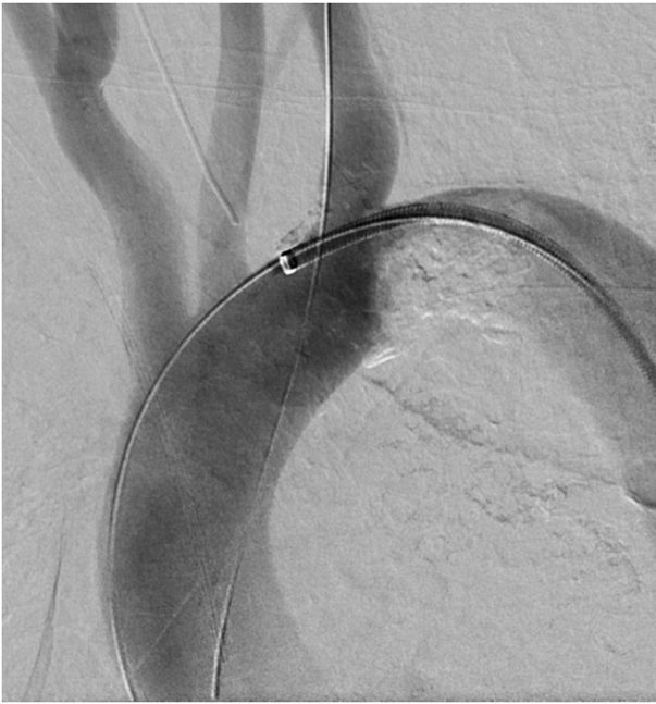
FIGURE 3. Positioning of the guides through the lesions before inflation of the stents by the chimney technique.

amendment of the mesenteric angina. At 5 months, the mean gradient was unchanged at 33 mm Hg, but the left ventricular excretion fraction was significantly improved to 39%.