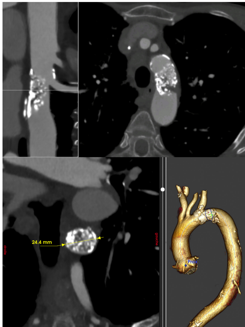
FIGURE 2. Straight views, orthogonal, and 3-dimensional reconstruction of the aortic arch stenosis.

channel measuring 1.5 mm at the superior part of the lesion in contact with the large aortic curvature, which opened the door to endovascular management. It was decided to use an undersized aortic stent and not to use a stent of a nominal aortic diameter due to the high risk of rupture when it is deployed. The choice was therefore focused on a strong stent with the benefit of a better radial force and a covered stent to prevent bleeding from possible wall lesions when the balloon is inflated. Given the lesions at the ostium of the left subclavian artery and the risk of overlapping them with the covered aortic stent, it was also decided to stent the left subclavian artery.