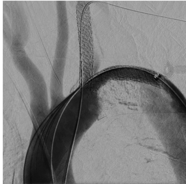
FIGURE 4. Per-procedural control angiography after placement of stents in the aortic arch and departure of the left subclavian artery.

Unlike porcelain aortas with parietal, circumferential, and multistage involvement, intra-aortic coral reef lesions are intraluminal and localized to the healthy aorta. These are rare but severe lesions that are often associated with surgical management by means of transaortic endarterectomy or extra-anatomic bypass. The origin of these lesions is unclear, but the most likely hypothesis is the secondary calcification of a thrombus. They most often affect young women, in a ratio of 1.6:1. Their prevalence is between 0.6% and 1.8% of the population, and they are predominantly found in the abdominal region and very rarely in the aortic arch. Only 3 cases in the isthmus have been identified in the literature. One of these 3 cases was not managed surgically due to the severity of the cardiac impairment, which led to the patient's death due to cardiogenic shock. 1 The 2 other cases, with maintained ejection fraction but myocardial hypertrophy, benefited from successful open surgery on the aortic arch. 2,3 In our case, open surgery was not conceivable due to the cardiac impairment. Given the favorable anatomy, we focused on endovascular management. After reviewing the literature, it became apparent