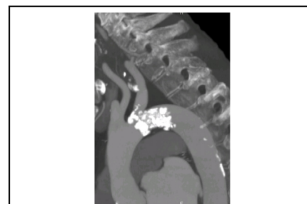
Sagittal view of the isthmic coralliform lesion.

https://doi.org/10.1016/j.jtc.2022.01.010