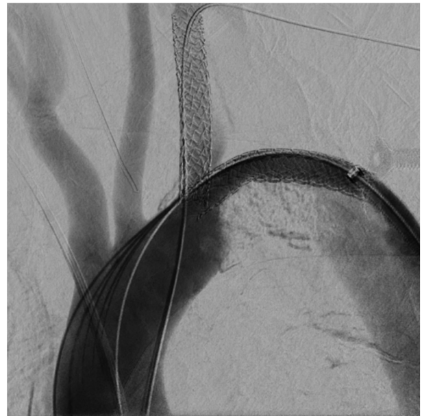
FIGURE 4. Per-procedural control angiography after placement of stents in the aortic arch and departure of the left subclavian artery.

Unlike porcelain aortas with parietal, circumferential, and multistage involvement, intra-aortic coral reef lesions are intraluminal and localized to the healthy aorta. These are rare but severe lesions that are often associated with surgical management by means of transaortic endarterectomy or extra-anatomic bypass. The origin of these lesions is unclear, but the most likely hypothesis is the secondary calcification of a thrombus. They most often affect young women, in a ratio of 1.6:1. Their prevalence is between 0.6% and 1.8% of the population, and they are predominantly found in the abdominal region and very rarely in the aortic arch. Only 3 cases in the isthmus have been identified in the literature. One of these 3 cases was not managed surgically due to the severity of the cardiac impairment, which led to the patient's death due to cardiogenic shock. 1 The 2 other cases, with maintained ejection fraction but myocardial hypertrophy, benefited from successful open surgery on the aortic arch. 2,3 In our case, open surgery was not conceivable due to the cardiac impairment. Given the favorable anatomy, we focused on endovascular management. After reviewing the literature, it became apparent