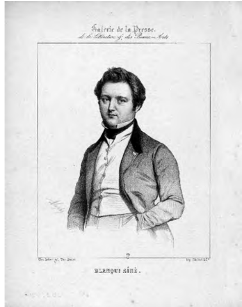
Figure 1. Adolphe Blanqui in 1841.