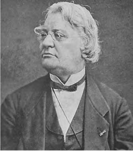
Figure 2. Joseph Garnier in the 1870s.