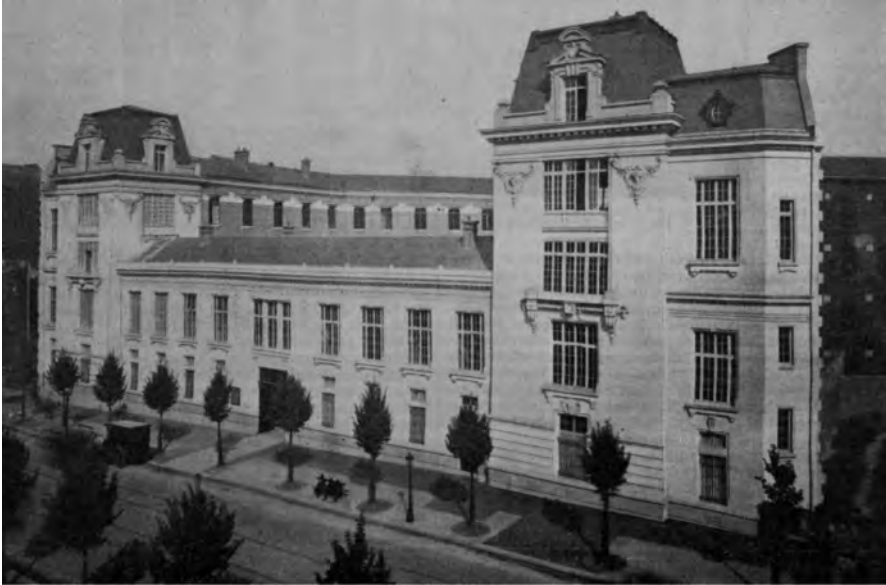
Figure 3. The new premises of the ESCP, avenue de la République in 1898.

Source: "Architecture – La nouvelle École supérieure de commerce à Paris," Le Génie civil : Revue générale des industries françaises et étrangères , n° 861, 10 décembre 1898, p.1, Archives of the École Nationale des Ponts et Chaussées, 2012-302223.