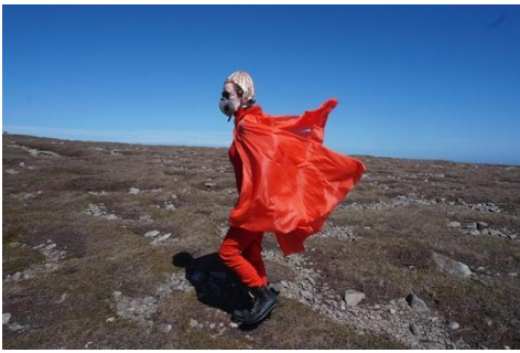
View of the expedition and particles trapping device, Fair Isle

Less geo -graphy than aero -graphy, Anais's journey re-traces on land the paths of carbon black through the atmosphere. Drawn up from the chimneys of factories and houses, from the exhausts of cars and lorries, from the erosion of tyre and tarmac, from the smouldering embers of forest fires, these molecules drift along atmospheric currents for days and falling back several hundred kilometers from their point of emission. This journey trouble our common sense, our local sense of cause and effect, action and consequence. Why are we so blind, so indifferent, to this atmospheric life of what goes up in smoke?