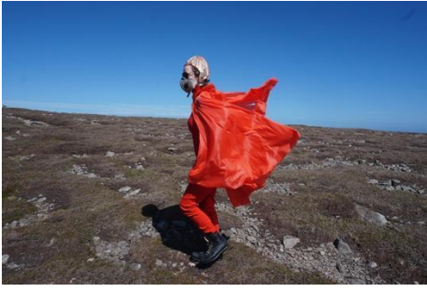
View of the expedition and particles trapping device, Fair Isle

Less geo -graphy than aero -graphy, Anais's journey re-traces on land the paths of carbon black through the atmosphere. Drawn up from the chimneys of factories and houses, from the exhausts of cars and lorries, from the erosion of tyre and tarmac, from the smouldering embers of forest fires, these molecules drift along atmospheric currents for days and falling back several hundred kilometers from their point of emission. This journey trouble our common sense, our local sense of cause and effect, action and consequence. Why are we so blind, so indifferent, to this atmospheric life of what goes up in smoke?