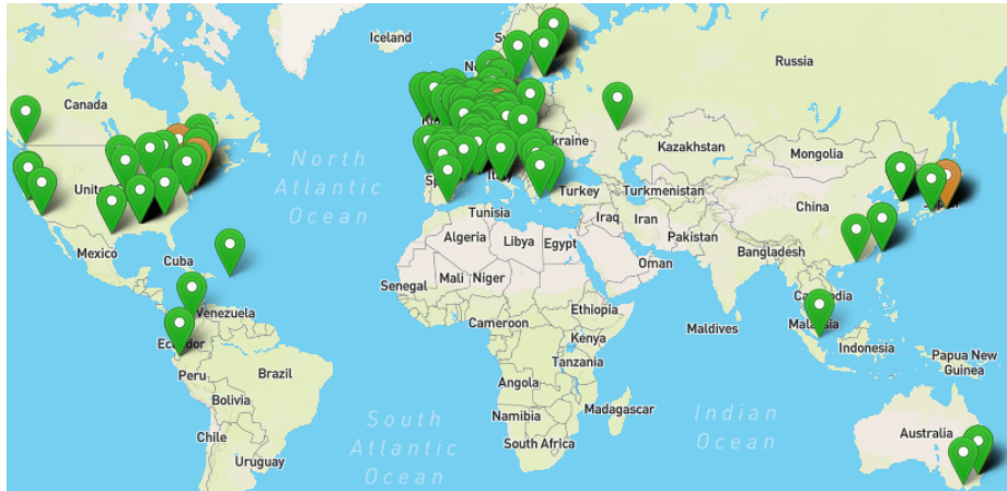
Fig. 3. Geolocation of the endpoints in KartoGraphI: green items represent an endpoints' IP locations; orange items represent endpoints that gave a timezone not matching this location.

will be given, as shown in the video available at http://prod-dekalog.inria.fr/SubmissionESWC2022 .