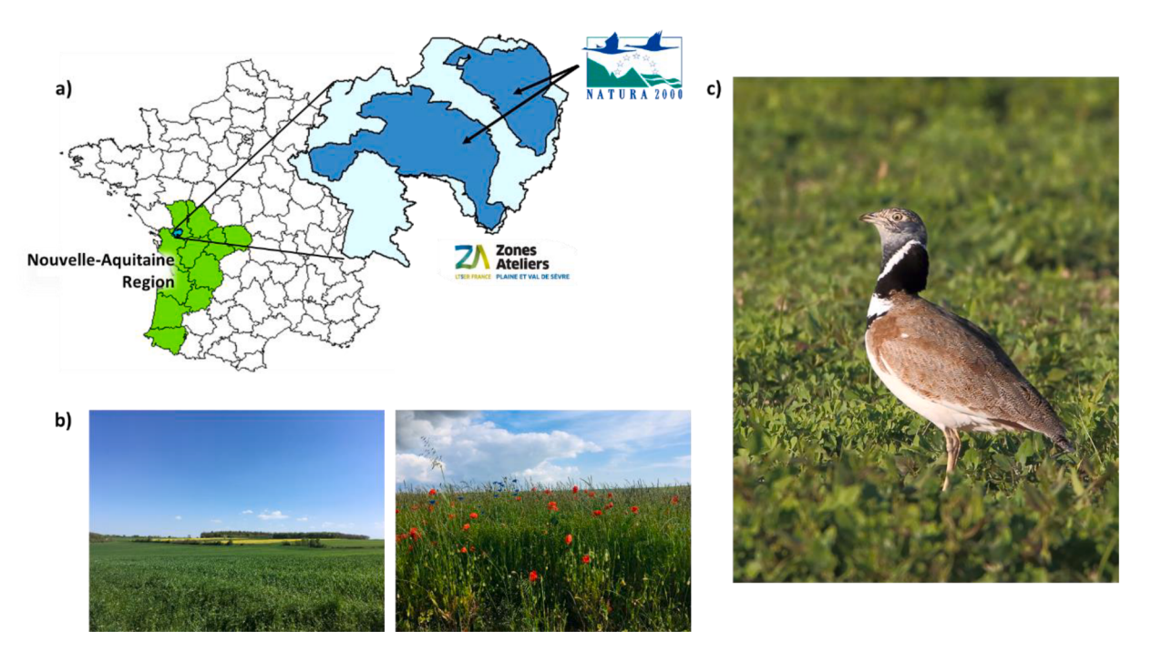
Fig. 1. The LTSER Plaine & Val de Sèvre. a) Location of the LTSER Zone Atelier Plaine & Val de Sèvre and delimitation of the Natura 2000 site; b) Landscape views; c) A male Little Bustard, one of the flagship species in the area.

the ZA PVS over the last 25 years to produce knowledge on the agroecosystem functioning and dynamics, as a first mandatory stage. Without being exhaustive, we highlight the multiple expansions of this generative research programme (Hatchuel et al., 2011) that is simultaneously related to scientific disciplines, protocols, the objects and ES taken into account, interactions with local stakeholders, and governance. We then analyse how, in relation to knowledge development and