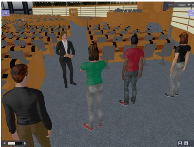
Figure 1: Virtual world created within the Reverie project.

Whilst recognized as extremely important in the context of the overall project, it could be argued that the treatment of ethical concerns followed a very traditional model and was thus, somewhat dis-connected to the thrust of technology development. That is, the study was carried out in parallel to the various work streams focused on definition of use cases, elicitation of functional and technical specifications and prototype development and validation. Also, the timing of the ethical work was such that the key conclusions and recommendations were only available towards the end of the project's lifetime. Thus, we argue that even though a debate on the ethical challenges had taken place, it was still situated outside the 'technical' scope of the research project. In contrast, we suggest that such a debate should be interconnected to the design of the system.