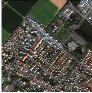
Fig. 1. Strasbourg high-resolution urban image