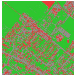
Fig. 4. CCA classification results

belief function framework. This classification is improved and optimized with a new conflict management approach. The conflict management is based on an automatic discounting factor calculation. The discounting factors are found using not only the BBA distance measure but also the confusion rate of belief function. The first classification result has improved thanks to the discounting factors determination. In future work, we will try to propose a complete classification approach based on fusion discounted pieces of evidence. This discounting will also associate an intrinsic and extrinsic measures for more adequate combination. Even if the results are satisfying on image classification, tests can be extended to UCI benchmarks to verify GDA contribution.