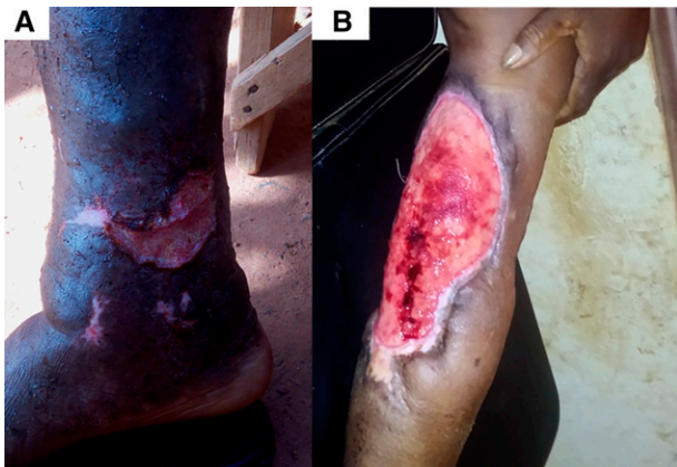
FIGURE 2. Photos of two skin ulcers from two patients. (A) Photo of patient's right leg skin ulcer P50 at the time of swab sampling in August 2018. (B) Photo of patient's left leg skin ulcer P31 at the time of swab sampling in August 2018. This figure appears in color at www.ajtmh.org .

Note: Supplemental table appears at www.ajtmh.org .