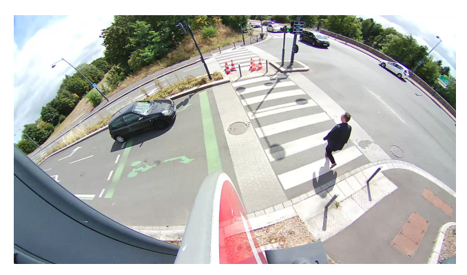
Figure 1: View of the road junction

In particular, we are interested in the subsystem based on machine learning, whose aim is to correctly detect and identify the various road users (vehicles, pedestrians, etc.) on the basis of images from the cameras. This subsystem is critical at the microscopic level, and a failure in detection can have serious, life-threatening consequences, as the decision to change the traffic lights is based on its detections. It is therefore imperative for this subsystem to be reliable.