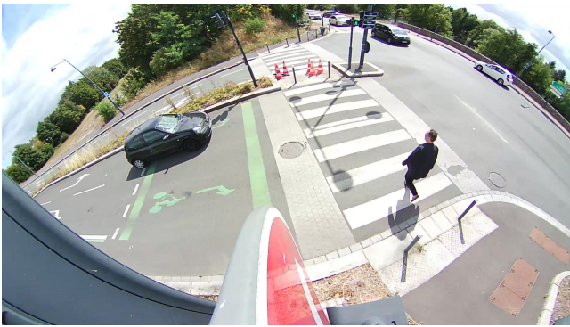
Figure 1: View of the road junction

In particular, we are interested in the subsystem based on machine learning, whose aim is to correctly detect and identify the various road users (vehicles, pedestrians, etc.) on the basis of images from the cameras. This subsystem is critical at the microscopic level, and a failure in detection can have serious, life-threatening consequences, as the decision to change the traffic lights is based on its detections. It is therefore imperative for this subsystem to be reliable.