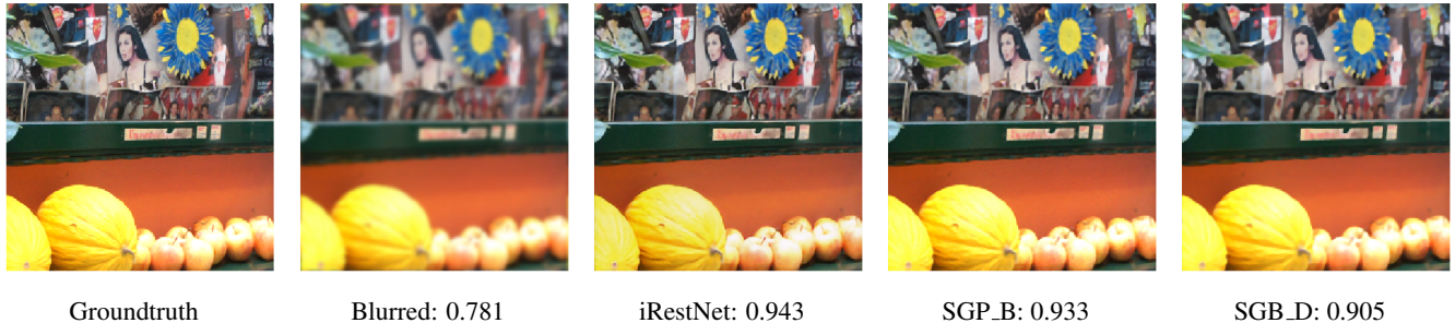
Fig. 3: Visual results and SSIM obtained with the different methods on one image from Flickr30 test set degraded with GaussA.