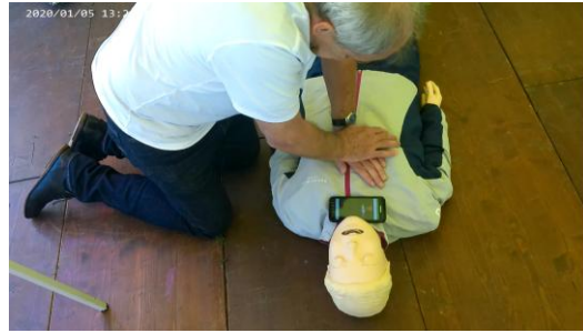
Figure 3: Soft arms

The second benefit is the presence of sound to signal every compression as well as the sight of someone performing a massage. It helps the participants to synchronize with the video and find the "right rhythm". Such was the case for PP3 "I heard the beep, that's when I saw that I had to go much faster", PP1: "we have to go very, very quickly, press very hard, the rhythm, we follow it with the video, it's something very pleasant" or PP2: "it really gives me the right rhythm for a cardiac massage".