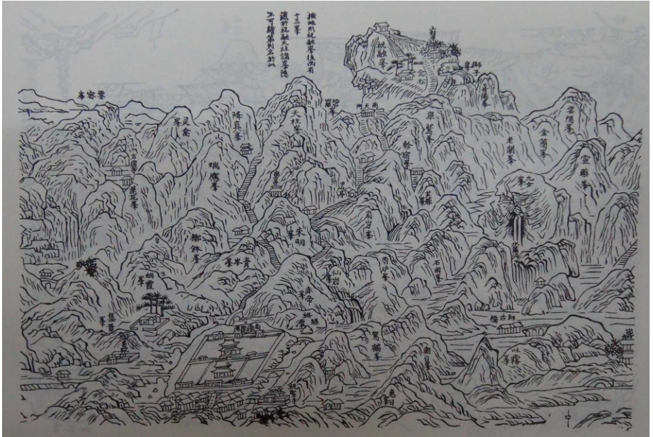
“Map of the Seventy-Two Peaks of the Southern Marchmount” Nanyue qishier feng tu 南嶽七十二峰圖 (1619)

three million “pilgrim-tourists,” 5 who come mainly from south-central China (Hunan, Jiangxi, Hubei, Guangdong).