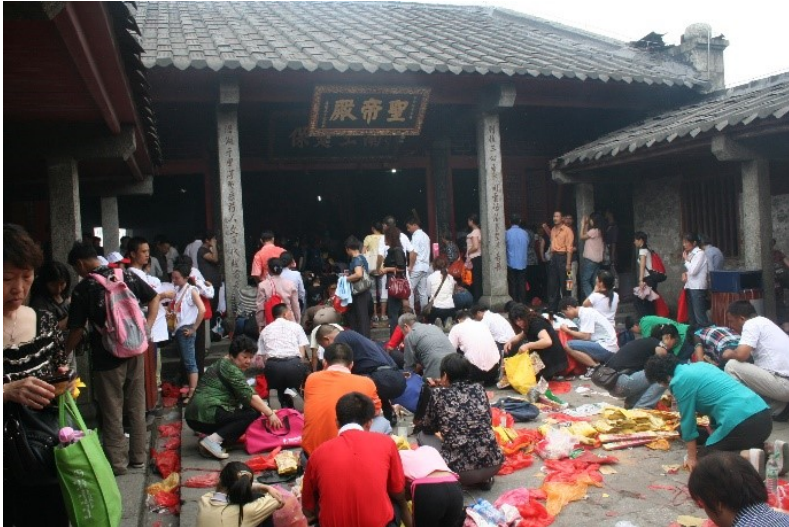
Pilgrims presenting wishes and prayers to the Sage Emperor.

has become the headquarters of the various official religious associations ( zongjiao xiehui 宗教協會) of Hunan province, providing intermediation between religious and social networks, on the one hand, and the Communist Party and the State, on the other (Favraud 2011).