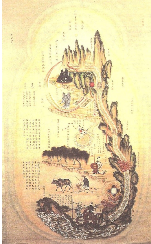
Neijing tu 內景圖 (Chart of the Inner Landscape), from Zhongguo gudai yishi tulu 中国古代仪式图录. (Despeux 2018; Komjathy 2008; 2009).

side to give up not only the paved streets of the cities but also their shoes, continuing their path in bare feet. 7