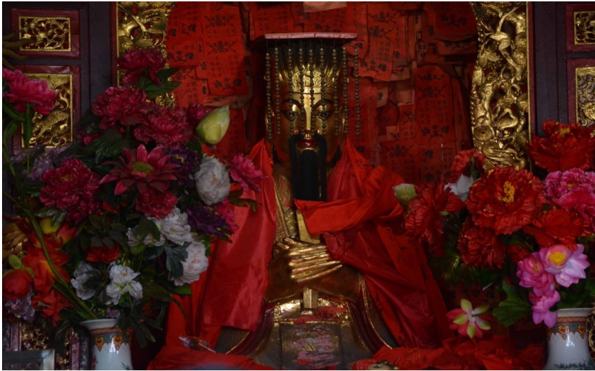
The Sage Emperor of the Southern Marchmount, also called Sage Emperor [our] Paternal Grandfather (Shengdi laoye 聖帝老爺).

The entire process of pilgrimage forms part of the Chinese organization of the divine in the form of a celestial hierarchy, which duplicates the organization of the imperial bureaucracy. Practitioners formulate recollections, demands, sufferings, or thanks from within themselves and utter them aloud in an immediate setting that includes other pilgrims and ritualists, divine statues and mountains. After a long walk, they often present formal requests to an idealized civil servant under imperial rule. In central and southern China, the main deity fulfilling this role is the Sage Emperor of the Southern Marchmount.