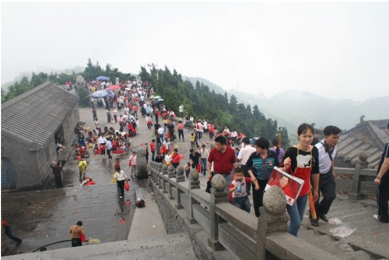
Pilgrim-tourists climbing to reach the temple on the Peak of the Smelter-Invoker (Zhurong feng 祝融峰).

This explains why its ancient politico-religious function continues actively in the contemporary context of the post-Mao era. From the founding of the empire in 221 BCE through the Middle Ages, the mountain served as the ritual marker of the southern border of Chinese civilization within the system of the Five Marchmounts ( wuyue 五嶽). A place of worship, a trading post, and an advanced military fort in “barbaric” territory until around the 15 th century (see Wang 1973), it was a meeting place between various Han and non-Han populations. In the Tang dynasty (618-907), it moreover became a center of monastic knowledge and power, expressed in all three traditions of Buddhism, Daoism, and Confucianism. Here the “great” Chinese traditions entered into interaction and competition, among each other as well as with local and regional cultures (Robson 2009).