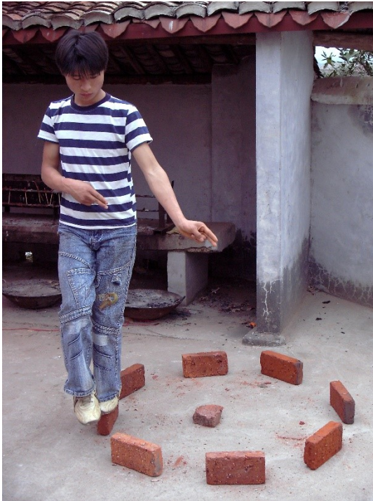
A young man trains in martial and therapeutic stepping, balancing on bricks that symbolize the eight trigrams ( bagua 八卦) in the forecourt of a local temple in Liling, Hunan.

Externalization appears most obviously in the martial arts, exorcist rituals, and therapeutic practices such as healing exercises ( daoyin 導引) and taijiquan 太極拳. More specifically, "stepping techniques" ( bufa 步法) are commonly used in the construction of ritual areas, such as altars ( tan 壇) or ritual areas ( daochang 道場), and land planning through geomancy ( fengshui 風水).