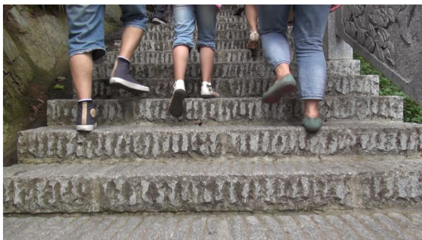
Climbing the stone stairs of the pilgrimage path.

Having respectfully followed the movement of the Way, Arriving halfway, effort is still necessary. It is not far to come back to yourself, But to reach the top, do not hesitate to be persistent. 8