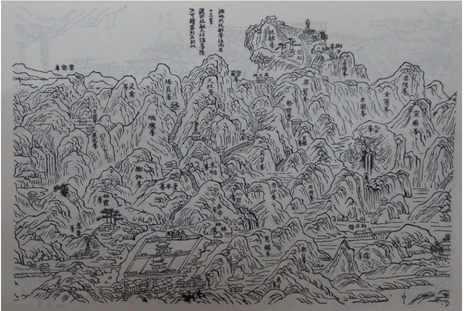
“Map of the Seventy-Two Peaks of the Southern Marchmount” Nanyue qishier feng tu 南嶽七十二峰圖 (1619)

three million “pilgrim-tourists,” 5 who come mainly from south-central China (Hunan, Jiangxi, Hubei, Guangdong).