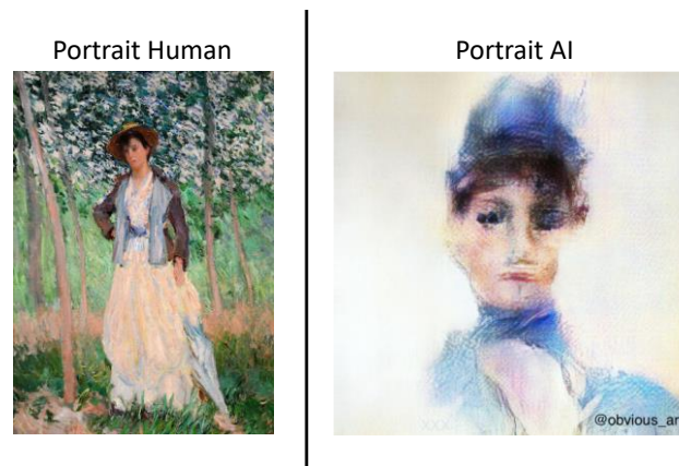
Figure 1. Examples of used art paintings (Human: The Stroller - Claude Monet; AI: Madame De Belamy - @obvious_art)

Following Pasquier [44], the selection of pieces of art was influenced by their similarity in order to conceal their authorship. For this purpose, 40 impressionist-style paintings made by Piet Mondrian, Claude Monet, Robbie Barrat, and the collective Obvious were selected 3 (see Erreur ! Source du renvoi introuvable. for examples).