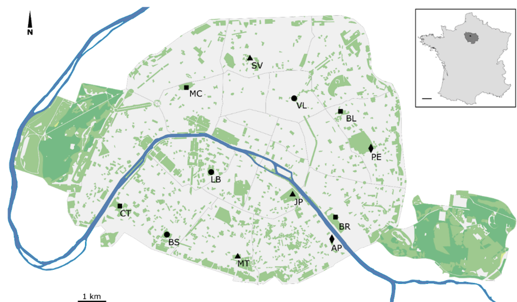
Figure 1. Distribution of the 12 green spaces surveyed in 2019–2020 in the city of Paris. Green: green spaces; grey: built environment; blue: Seine river. Triangles: biodiversity reservoirs with restricted access; diamonds: small ecological parks; squares: biodiversity refuges within large parks; circles: classical gardens. Insert: light grey represents continental France, dark grey represents the Ile-de-France region, which comprises Paris (black dot); the scale bar represents 100 km. Background map: E. Gaba (data: IAU IdF, ODbL, CC BY-SA 4.0, https://commons.wikimedia.org/w/index.php?curid=38508343 (accessed on 15 February 2022)).

dedicated refuge spaces to accommodate biodiversity (BL, CT, MC, BR); (4) classical gardens with a predominantly ornamental style (preference for horticultural plants and frequent weeding) (BS, LB, VL). The 12 green spaces are managed by diverse stakeholders (for the most part the Paris City Council) and have different histories: some are large historical parks that have undergone transformations over the centuries (MC, JP); other former convents or private mansions (VL, LB, ST); though most are recent parks built on formerly residential or industrial land (AP, BL, BR, BS, CT, PE). MT is located above a buried hydraulic structure dating from 1873. These different histories and management practices appear to result in contrasting herbaceous floral diversity. This and more detailed information on the green spaces surveyed can be found in Appendix A Table A1.