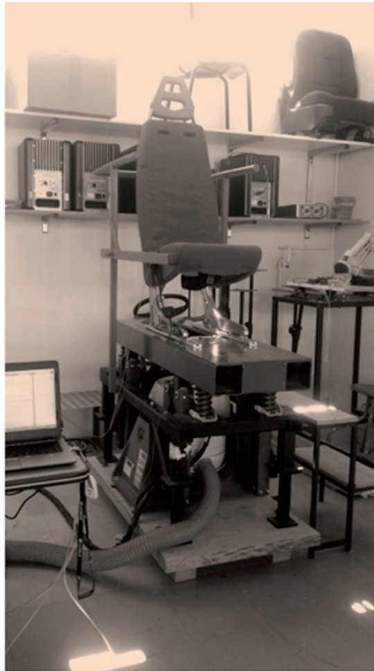
Figure 1. Picture of the bench and the helicopter seat used for this experiment.