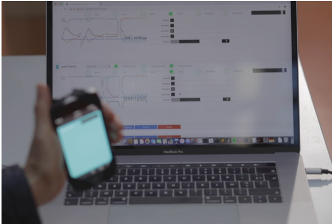
Controller interface of the CoMo application