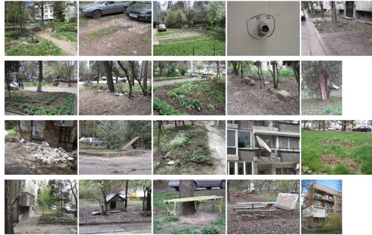
Fig.1 – Photographic survey of the inhabitants' interventions in Lozenets by Emilie Calvet, Master 1 thesis, ENSA Toulouse

Today, numerous developments are appearing in the areas between two construction unit blocks and the ground floor of the buildings are being occupied. Several parts of the exterior areas have been privatized by the inhabitants. This privatization is marked by painted wooden fences which enclose a space that is generally furnished with self-built garden furniture, well-tended plantations and a floor covering borrowed from town center public spaces.