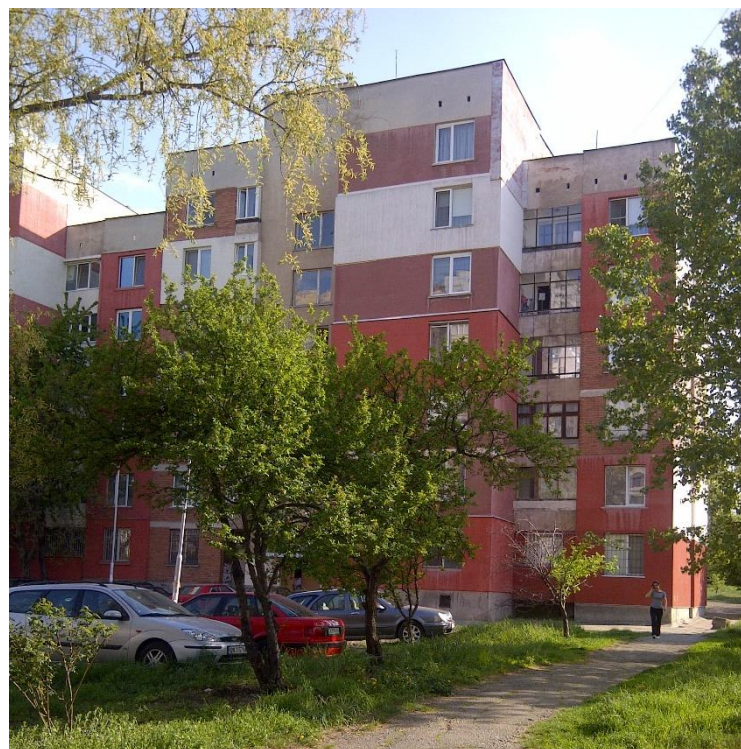
Fig.3 – Transformations of a residential building in Lyulin

The Lyulin gilo-district, in the west of the city center, is the largest in the Bulgarian capital. In the late 1960s, the Sofia Design Bureau (Sofprojekt) received a state order to build a socialist housing complex for 120,000 inhabitants on the site of the small village of Lyulin. The master plan was completed in 1969 and provided for the organization of the gilo-district into eleven micro-districts distributed along a cardo and a decumanus and a "green corridor", linking the "modern center" to the Zapaden park located to the south. This gilo-district was partly built in the seventies and eighties. Constructions kept built after the fall of the socialist regime, but in a haphazard manner and were often left to private investors.