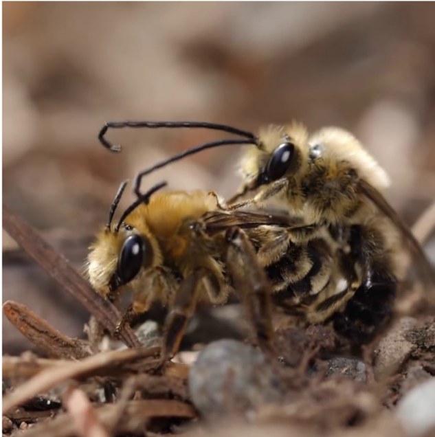
Figure 2. The mating of Melissodes bees.

males chasing females in complex flight maneuvers, grasping them either in flight or at the ground level and rolling with them repeated times in what Turner described as a “dance” in an article full of poetic impressions (Turner 1908c): “No skilled musician plays entrancing tunes, but as they dance, each bee makes music with its wings.” After describing this complex parade (Figure 2), Turner concludes that this behavior is a “nuptial ambuscade since it is a device, which promotes sexual union.” This could be obvious today, but at a time, in which this behavior had neither been described, nor analyzed, the eye of a scientist was required to make the correct conclusion.