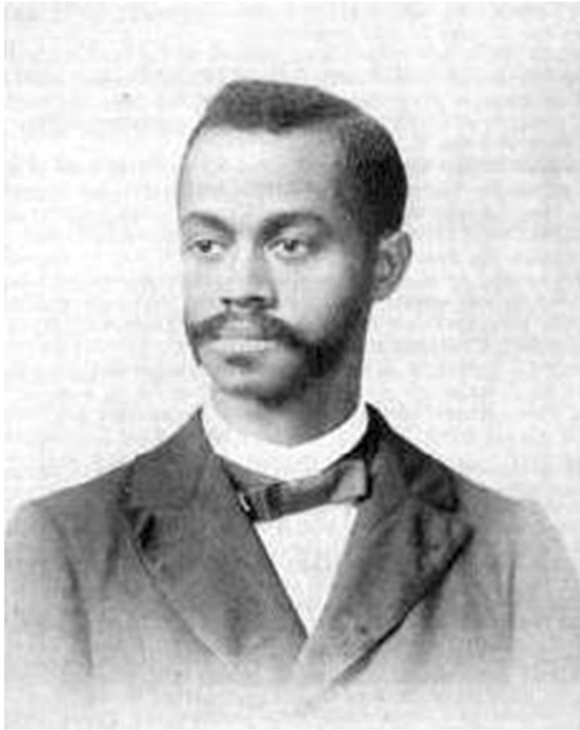
Figure 1. Charles Henry Turner.