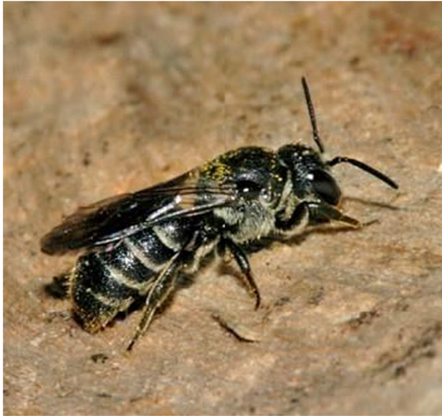
Figure 3. A parasitic bee from the genus Stelis .

from a memory store the information that guided its decision. Turner concludes, “By a process of elimination, the most consistent explanation of the above behavior is the assumption that burrowing bees utilize memory in finding the way home, and that they examine carefully the neighborhood of the nest for the purpose of forming pictures of the topographical environment of the burrow.” He even specified that the process of forming these memory pictures occurs upon departure from the nest, in particular if modifications of the surrounding landmarks were introduced experimentally.