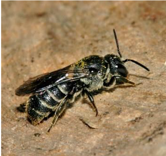
Figure 3. A parasitic bee from the genus Stelis .

from a memory store the information that guided its decision. Turner concludes, “By a process of elimination, the most consistent explanation of the above behavior is the assumption that burrowing bees utilize memory in finding the way home, and that they examine carefully the neighborhood of the nest for the purpose of forming pictures of the topographical environment of the burrow.” He even specified that the process of forming these memory pictures occurs upon departure from the nest, in particular if modifications of the surrounding landmarks were introduced experimentally.