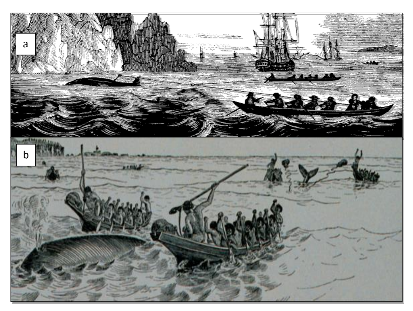
Figure 3: Whaling scenes: (a) English whalers in the North Atlantic, 19th century (Cheever, 1853) and (b) Makah Indians, Washington State, USA (Elliott, 1886)

dive without endangering the boat, while allowing the whalers not to lose track of it. By following the line, the whalers could then re-approach to attach more harpoons and lines. Once the whale was very tired, the whalers approached it and killed it with long lances (Duhamel du Monceau, 1782). This very efficient method became the foundation of European (and subsequently American) industrial whaling (Reeves and Smith, 2007).