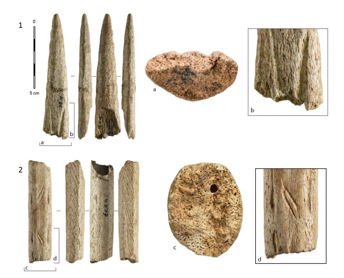
Figure 2. Examples of Magdalenian objects made in whale bone from Ermittia – level III (Guipúzcoa, Spain), 1: projectile point, 2: indeterminate object made on rod blank, a-d: close-up of the material. The porosity of whale compact bone tissue is perceptible by the presence of alveoli evenly distributed both inside (a, c) and on the surface (b, d) of the objects (modified from Lefebvre et al., 2021).

Whale bone specimens have often been overlooked or misidentified, so we begin this section with a brief overview of their main osteological characteristics. We then review the main types of information that can potentially be extracted directly from the bones: species identity (using collagen and ancient DNA); bone age (based on radiocarbon dating); evidence of use; and ecological information about whale populations themselves (using stable isotope and ancient DNA).