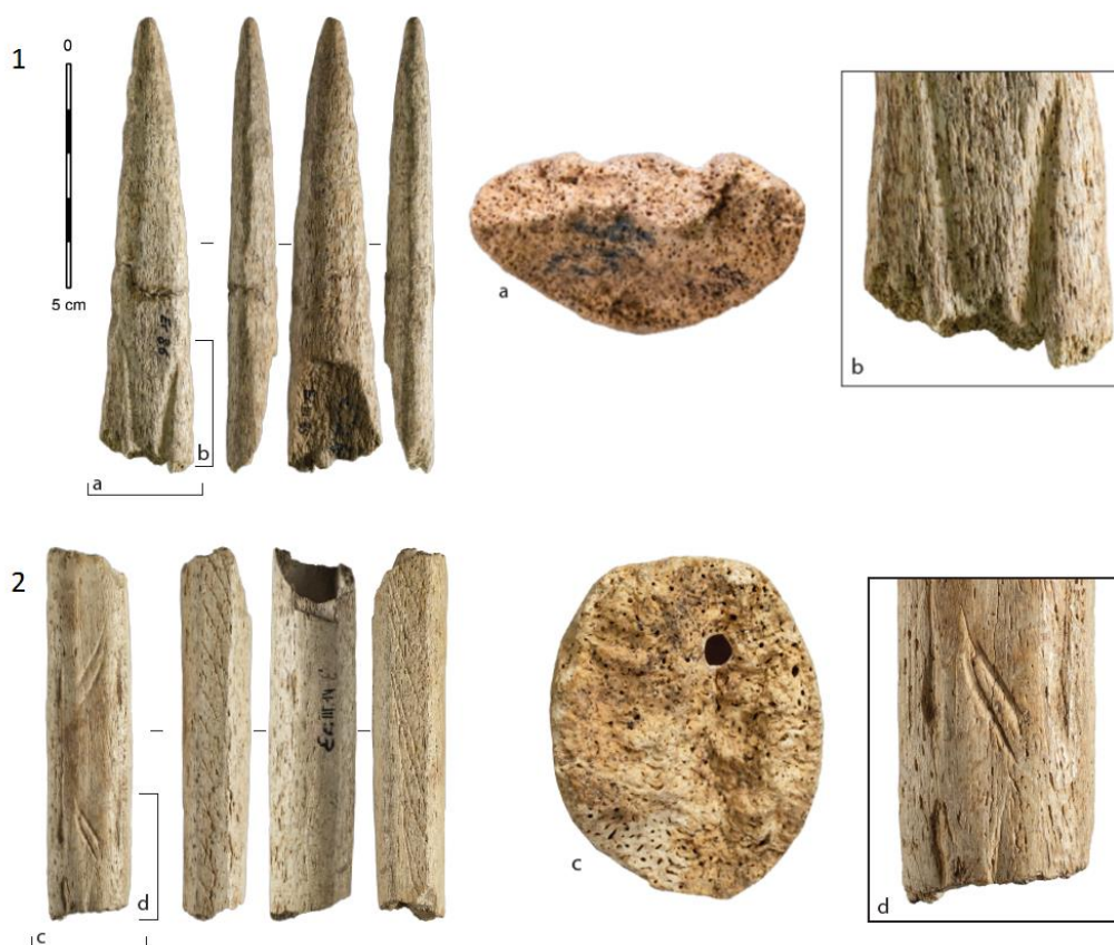
Figure 2. Examples of Magdalenian objects made in whale bone from Ermitia – level III (Guipúzcoa, Spain), 1: projectile point, 2: indeterminate object made on rod blank, a-d: close-up of the material. The porosity of whale compact bone tissue is perceptible by the presence of alveoli evenly distributed both inside (a, c) and on the surface (b, d) of the objects (modified from Lefebvre et al., 2021).

Whale bone specimens have often been overlooked or misidentified, so we begin this section with a brief overview of their main osteological characteristics. We then review the main types of information that can potentially be extracted directly from the bones: species identity (using collagen and ancient DNA); bone age (based on radiocarbon dating); evidence of use; and ecological information about whale populations themselves (using stable isotope and ancient DNA).