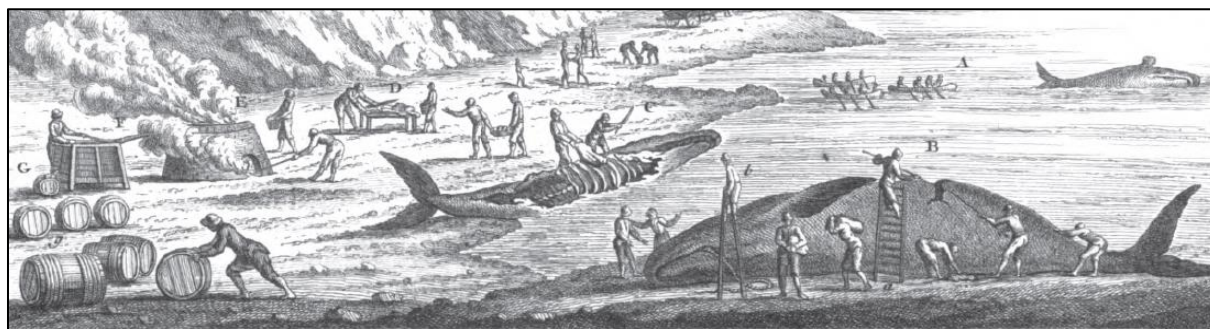
Figure 1 : Whale processing by Basques in Spitzbergen, showing a whale being towed to shore (A), blubber extraction (B and C), blubber chopping (D), oil rendering in ovens (E) and storage in wood casks (G) (Duhamel du Monceau, 1782).

Ancient relationships between humans and whales are however difficult to study, because whales can be quite invisible in the archaeological record (Smith and Kinahan, 1984). Indeed, given their enormous size, they were necessarily processed on the shore (Figure 1), their skeleton then broken down and dispersed by the action of the waves, leaving few or no archaeological traces. Even though whale bones can provide a valuable material, they are so large that they are seldom brought inland intact, being instead found as highly fragmented or transformed remains that are impossible to identify through traditional anatomical approaches. Other valuable whale resources – such as meat, blubber, and baleen – leave few or no archaeological records. This invisibility likely results in an underestimate of the value of whales to coastal populations, leaving many gaps in our understanding of ancient interactions between humans and the world’s largest animals.