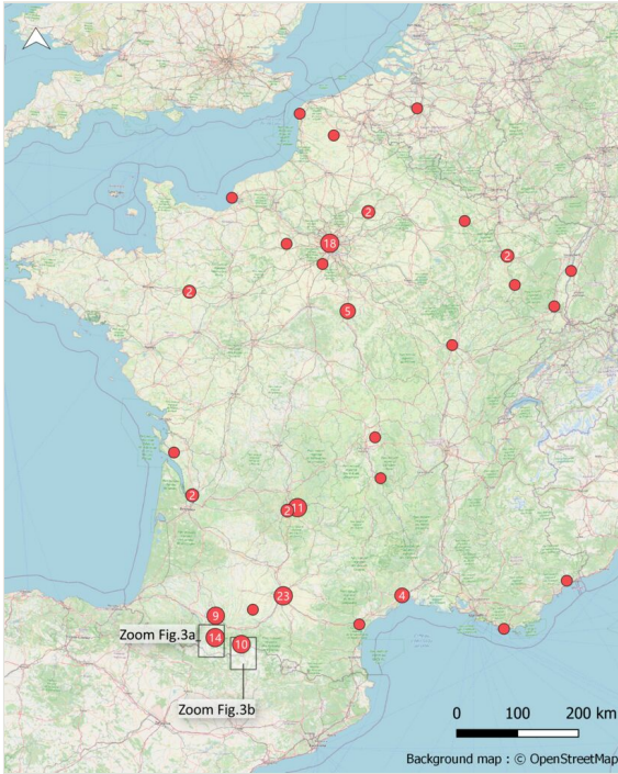
Figure 1. doi Spatial location of the 122 occurrences having data associated with coordinates.